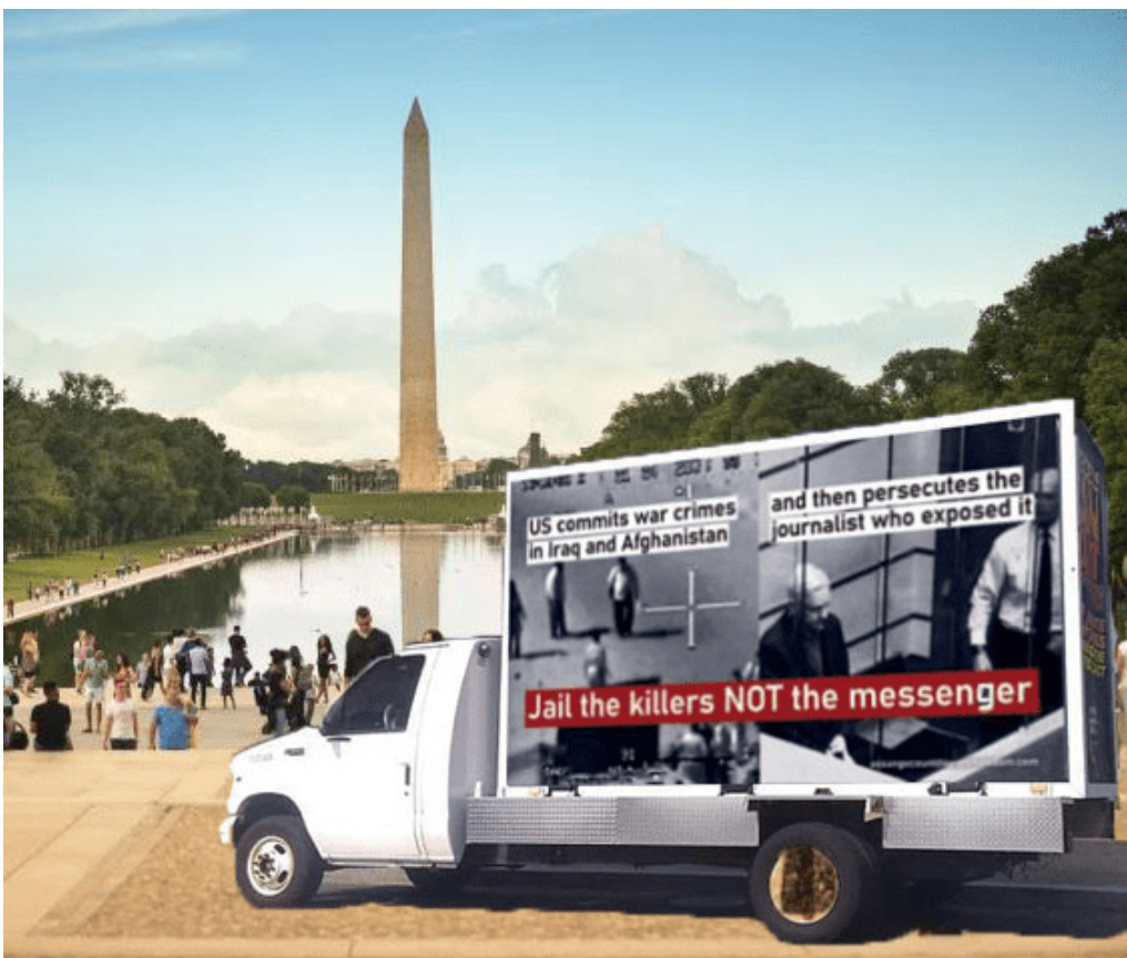
Billboard truck driving past Washington Monument.

They now show up and draw crowds at every iconic site in the nation's capital—from the Department of Justice to the Washington Monument to the Capitol Building to the White House. Thousands of residents and visitors to the nation's capital have seen them.