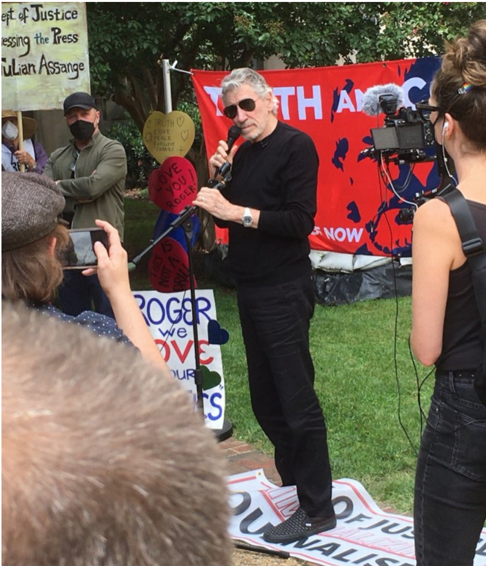
Roger Waters gives a thumbs up to Assange mobile billboard campaign in front of the Justice Department on August 17, 2022.

Waters also plans to deliver an ear-splitting, 100-decibel shoutout for Assange to more than 400,000 cheering fans during his “This Is Not a Drill” concert tour, a radical political rock extravaganza he is taking to more than 20 major U.S. and Canadian cities, including Washington D.C., New York City, Kansas City, Denver, Salt Lake City, Portland, Las Vegas, Dallas, San Francisco and Los Angeles, Montreal and Toronto.