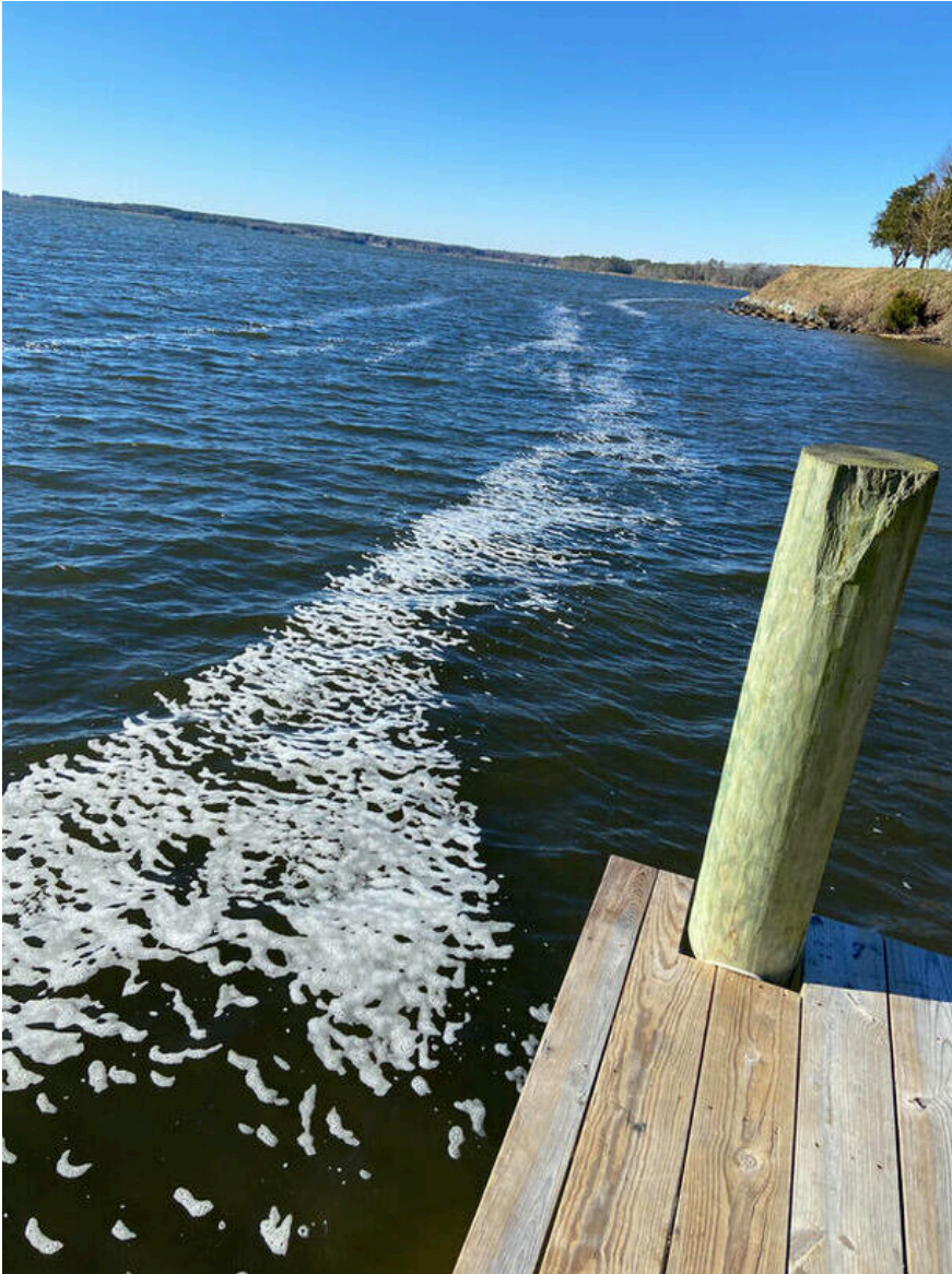
PFAS-laden foam travels across St. Inigoes Creek from Webster Field to my beach in Southern Maryland.