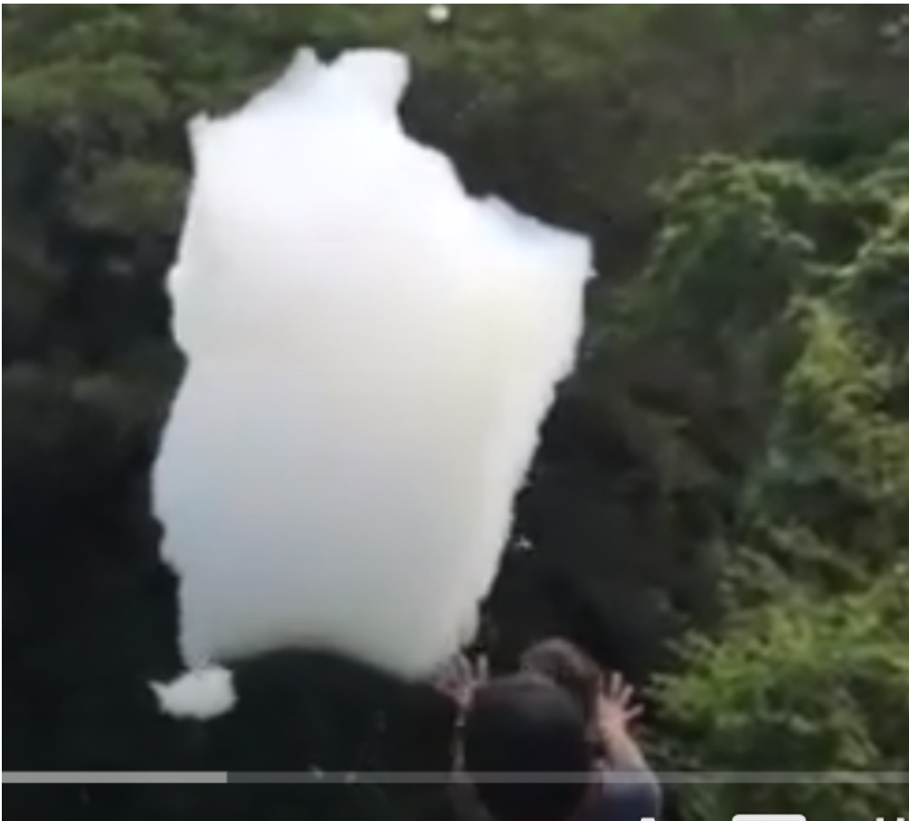
Okinawan children play with giant toxic “snowflakes” near the U.S. Marine Corps Air Station Futenma,

Last year, 9,000 kilometers away, a fire suppression system at an aircraft hangar discharged 143,830 liters of the deadly fire-fighting foam from Marine Corps Air Station Futenma in Okinawa. Carcinogenic clouds of foam soared 30 meters into the sky settling on children at a nearby playground.