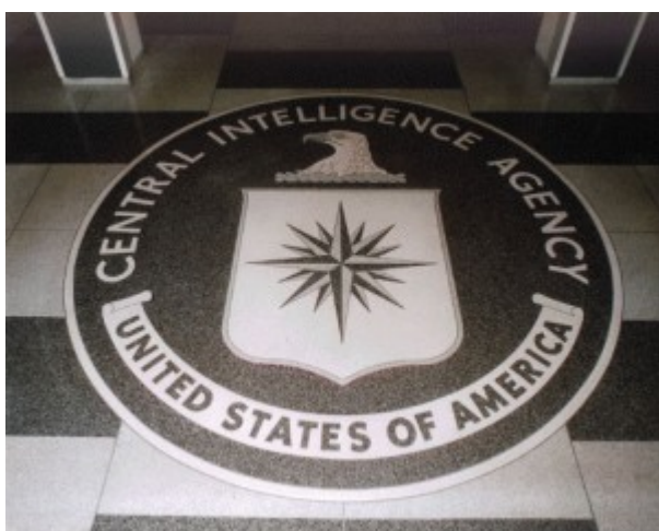
CIA seal in lobby of the spy agency’s headquarters.

So, what do powerful officials do when the bureaucracy comes up with “incorrect” conclusions? They send the analysts and investigators back to work until they come up with “correct” answers. This turned out to be no exception. Absent evidence of hacking directed by the Kremlin, the Germans now have opted for an approach by which information can be fudged more easily.