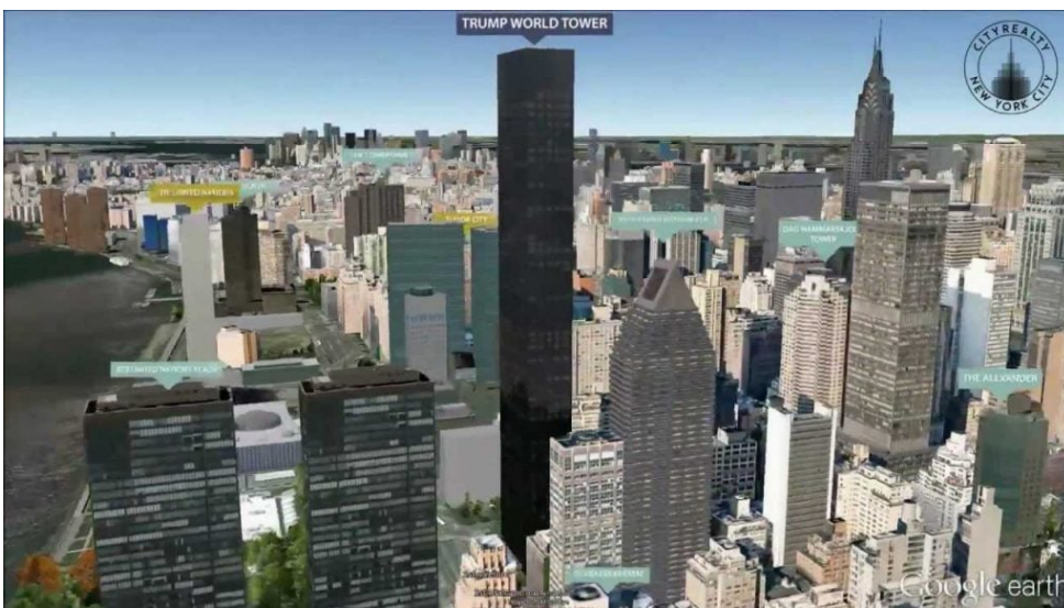
Trump World Tower Manhattan

The distance between Seoul and Pyongyang is about 121 miles, less than the distance between the Trump Tower in Manhattan and The Trump Taj Mahal Casino in Atlantic City (131 miles)