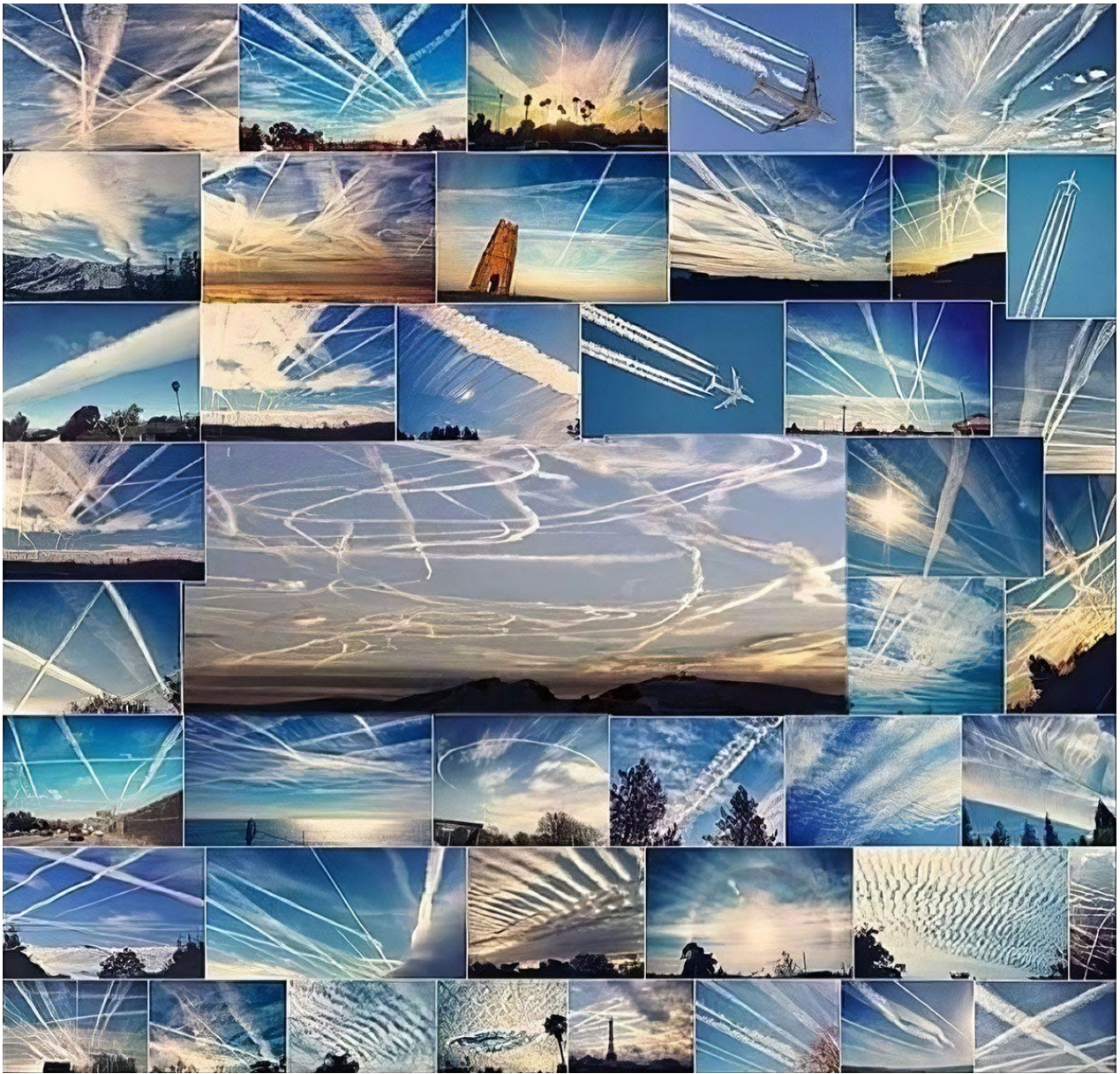
This photograph was taken by myself to show the use of weather modification in the state of Colorado.