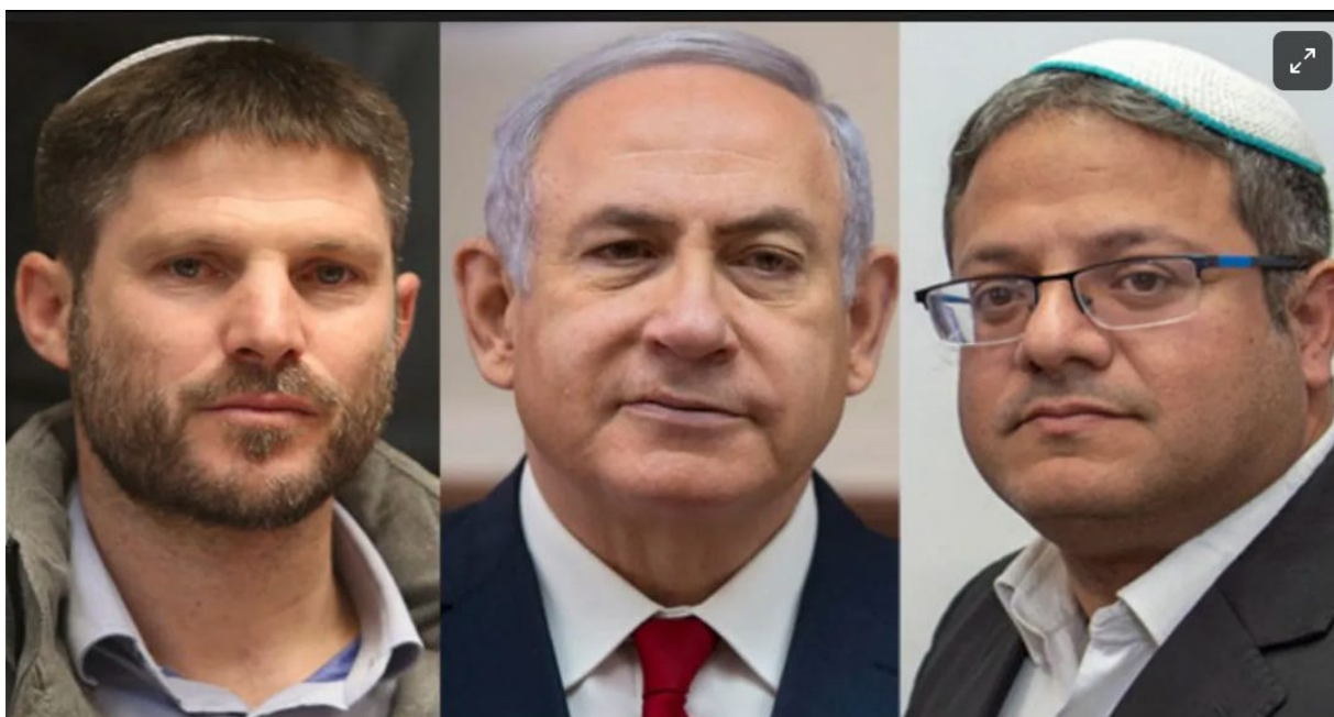
Bezalel Smotrich, Prime Minister Benjamin Netanyahu, and Itamar Ben-Gvir

To understand the possibility of such a drastic response to the Gaza Prison Break, it is important to realize Israel has never been governed by such a radical anti-Arab coalition in its entire history. By allying himself with the likes of Itamar Ben-Gvir and Bezalel Smotich , Netanyahu has entered the realm of the extreme Jewish Supremacist policies proposed by Rabbi Meir Kahane in the 1980s.