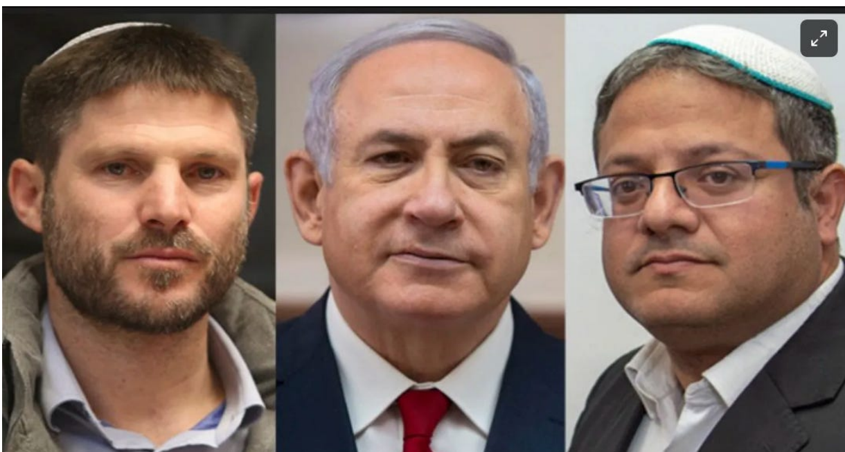
Bezalel Smotich, Prime Minister Benjamin Netanyahu, and Itamar Ben-Gvir

To understand the possibility of such a drastic response to the Gaza Prison Break, it is important to realize Israel has never been governed by such a radical anti-Arab coalition in its entire history. By allying himself with the likes of Itamar Ben-Gvir and Bezalel Smotich, Netanyahu has entered the realm of the extreme Jewish Supremacist policies proposed by Rabbi Meir Kahane in the 1980s.