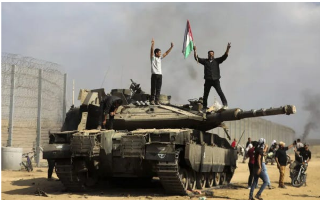
Palestinians wave their national flag and celebrate by a destroyed Israeli tank at the Gaza Strip fence east of Khan Younis on Saturday.