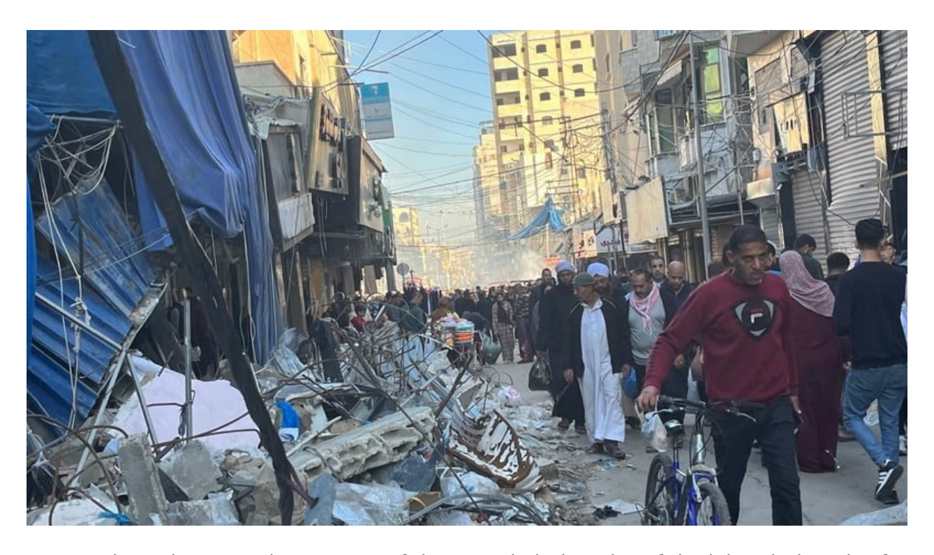
I cannot hear that: nor the screams of the wounded, the cries of the injured, the cries for lost parents, lost children, lost lives; the cries of those trapped under the wreckage of their homes;

I can see the photos: neighbourhoods crumpled and flattened by thousands of bombs; craters where buildings and streets used to be; people, small by comparison to the deluge of destruction, digging with bare hands through the tangled rubble of steel and mortar; people, frozen in time, calling for help, beseeching the world, damning the world, nowhere to turn, no escape from the whistle and rumble of bombs and missiles;