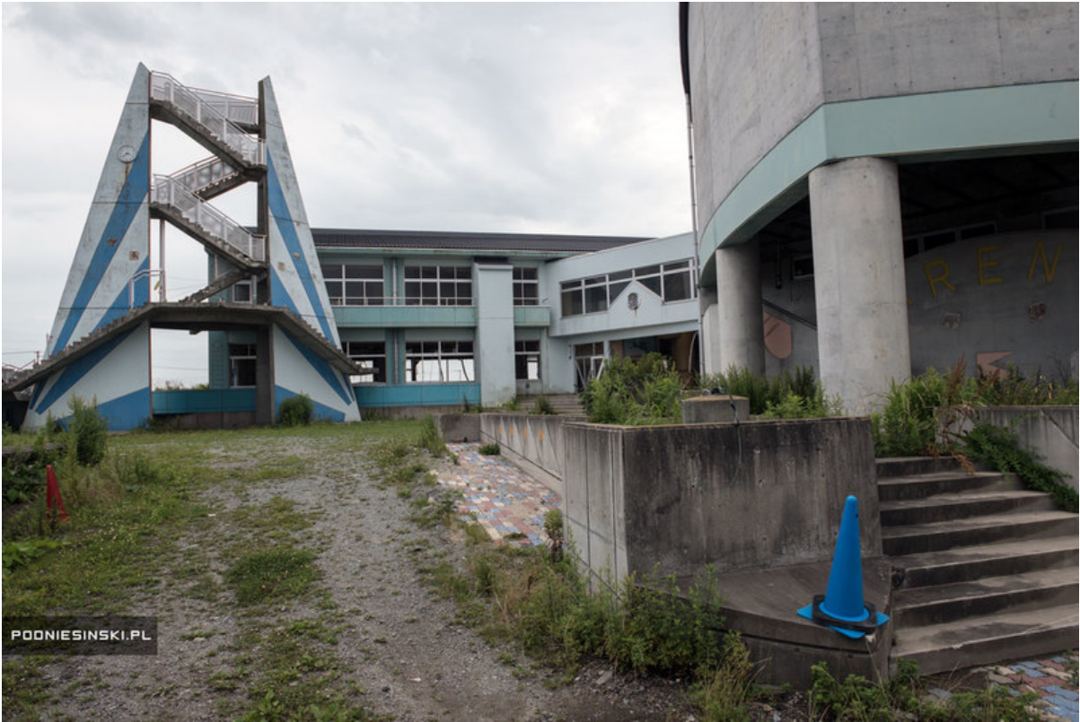
The Ukedo primary school building survived just 300 meters from the ocean.