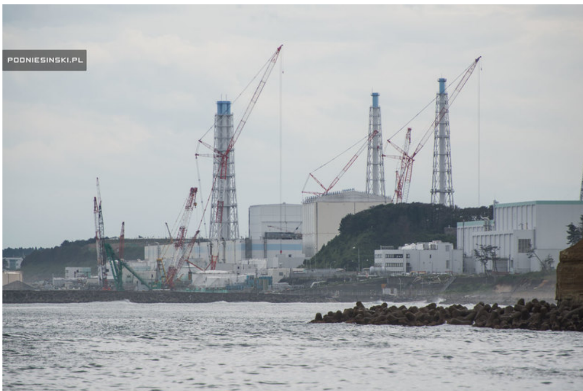
The damaged Fukushima Daiichi Nuclear Power Plant

Photographer and filmmaker Arkadiusz Podniesiński, who began visiting and photographing Chernobyl in 2007, documents his 2015 visit to the radiated zone around the Fukushima Daiichi Nuclear Power Plant. His photographs show the far-reaching and continuing effects of the triple disaster of March 11, 2011 compounded by earthquake, tsunami and nuclear meltdown. Podniesiński highlights both the desperate lives of thousands who continue to live in limbo, in government emergency housing, unable to return home, but also the plight of some who have chosen to return. (The Asia-Pacific Journal)