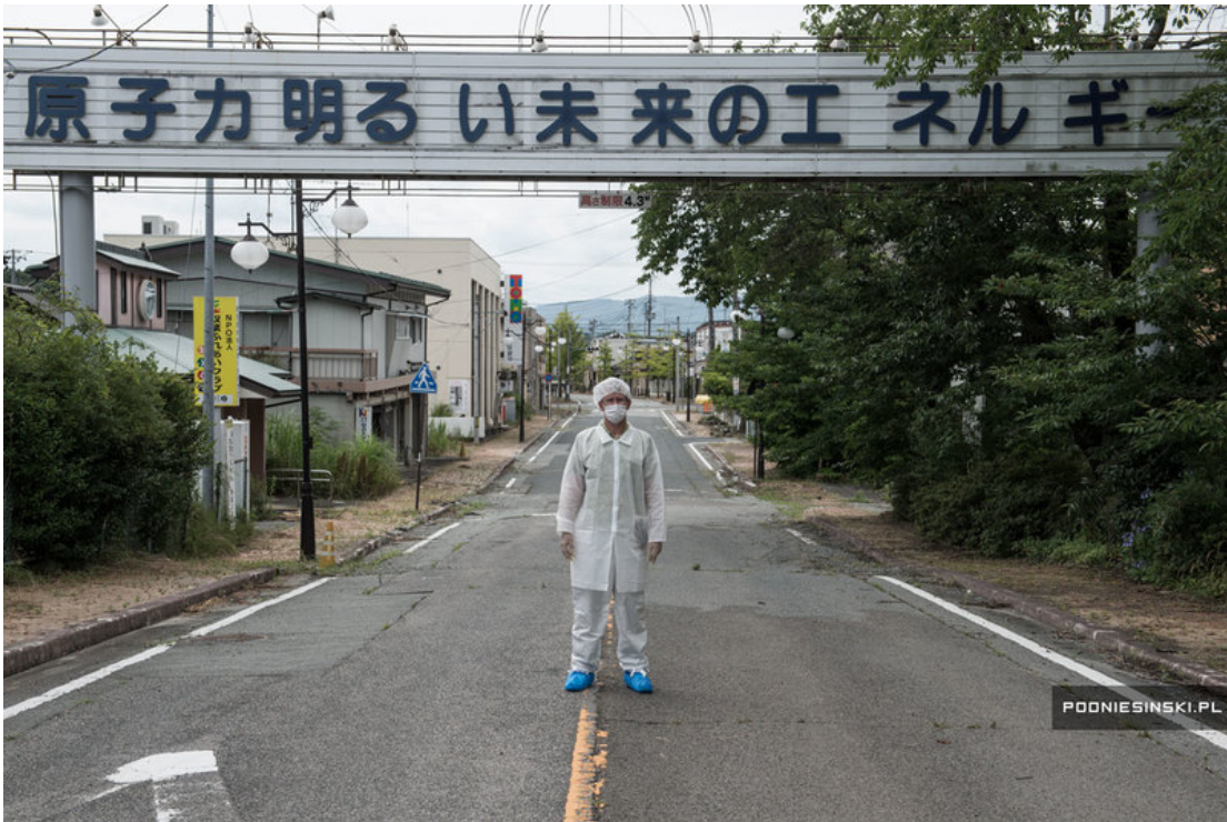
Sign above one of the main streets of Futaba proclaims: "Nuclear power is the energy of a bright future"