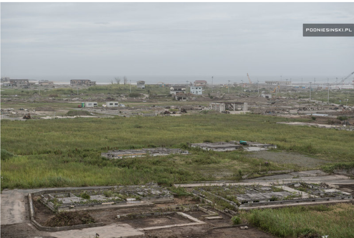
Remains of destruction in the aftermath of the tsunami, seen from the school's observation tower.