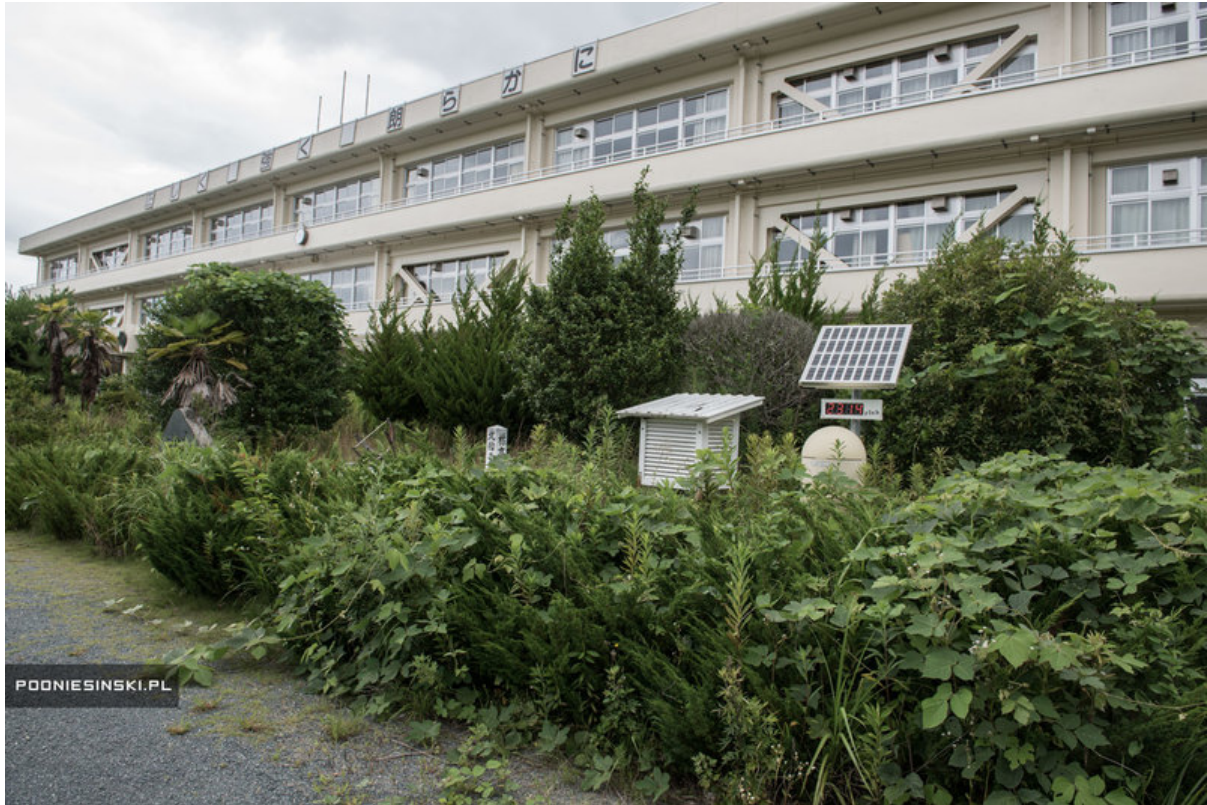
A school in Futaba. A dosimeter showing a radiation level of (2.3 uSv/h).

Tani Kikuyo (age 71) regularly visits the house from which she and her husband Mitsuru were evacuated, but they are permitted to enter only once a month for a few hours at a time. They continue to visit even though they have long ago given up hope of returning permanently. They check to see if the roof is leaking and whether the windows have been damaged by the wind or wild animals. Their main reason for returning however is a sentimental one.