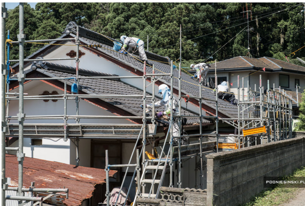
The roofs of all the buildings are hand-cleaned tile by tile.

Decontamination work is not limited to removal of contaminated soil. Towns and villages are being cleaned as well, methodically, street by street and house by house. The walls and roofs of all buildings are sprayed and scrubbed. The scale of the undertaking and the speed of work are impressive. The workers are making every effort to clean the houses so that residents can return as soon as possible.