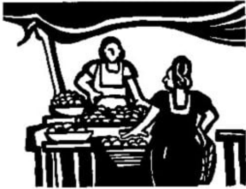
Street vendor (Drawing: Rini Templeton)

The food corporations began by colonising the existing, dominant food distribution networks of small-scale vendors, known as tiendas (the corner stores). There are some 400,000 tiendas , estancillos or misceláneas premises in Mexico, stores smaller than 10 square meters which carry a limited variety of products and are equipped with a limited amount of refrigeration and inventory. 22