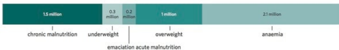
Graph 2. 5.1 million Mexican children under the age of 5 suffer from malnutrition

Obesity and diabetes function together, interacting so strongly that a new name has emerged: “diabesity”.