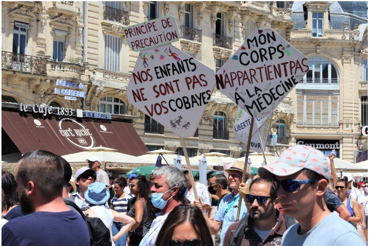
“Our children are not guinea pigs” “My body does not belong to medicine”