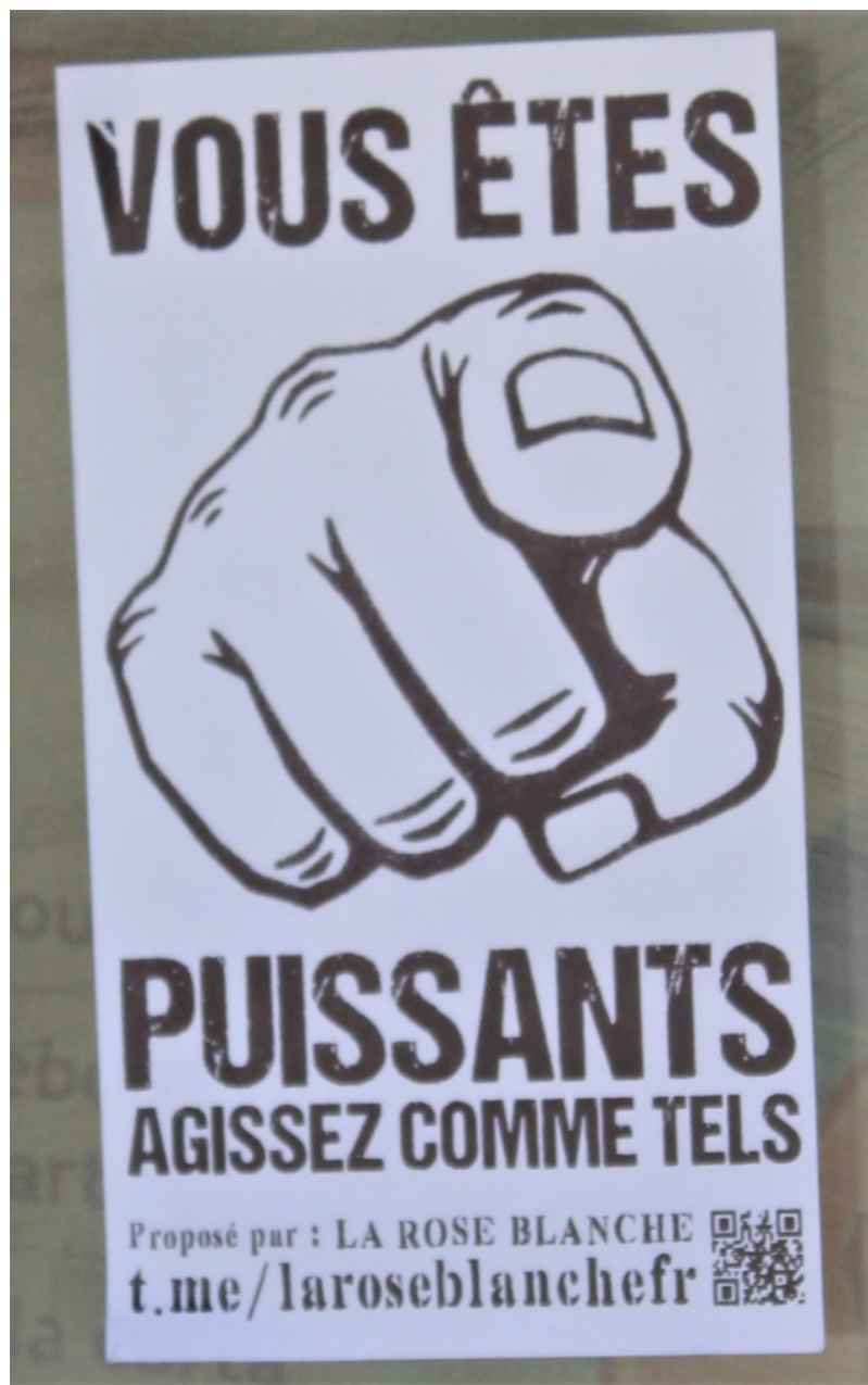
You are powerful, Act like it.