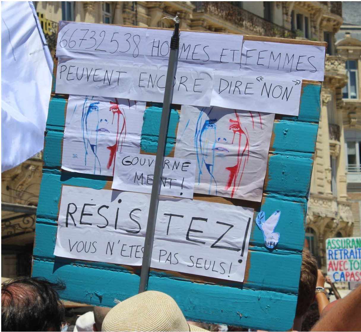
66 million men and women can still say no. Resist! You are not alone!