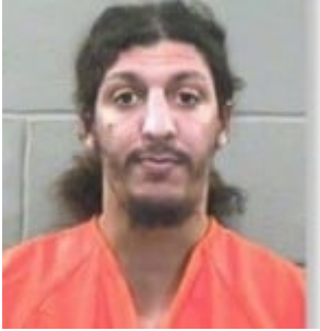
Richard Reid, hapless dupe.

testimony before the House Committee on Homeland Security. Allowing Abdulmutallab to keep the visa increased chances federal investigators would be able to get closer to apprehending the terror network he is accused of working with, “rather than simply knocking out one soldier in that effort.”