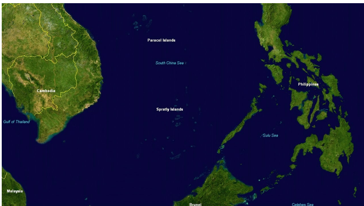
The location of the Spratly and Paracel Islands in the South China Sea.

Through its claims, the Philippines has, in part, sought to limit the nautical miles that China can claim for exploration and development. In fact, the Philippines brought the case against China to the Permanent Court of Arbitration tribunal exclusively as a maritime dispute and not a territorial dispute as an ipso facto means of extending the EEZ of the Philippines and reducing China's EEZ.