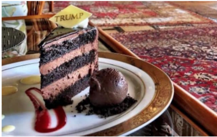
Donald Trump told President Xi of Syria strikes over a "beautiful piece of chocolate cake"

The Daily Telegraph, 7 April 2017 (scan right)