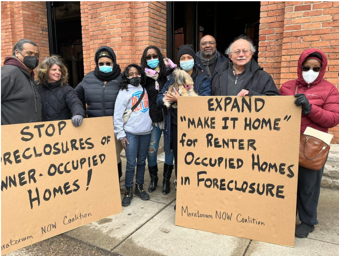
Detroit Moratorium NOW! Coalition demonstration outside Wayne County Treasurer on March 30, 2022

Activists gathered outside at 400 Monroe, the Wayne County Treasurer, on March 30 welcoming the extension of the halt to foreclosures and auctions of owner-occupied homes, however, emphasizing that renters and those owing taxes prior to 2017, are also in dire need of protection from homelessness. Auctioning of owner-occupied homes among other properties in Detroit has not resulted in any revitalization of neighborhoods where people are still leaving in the thousands every year.