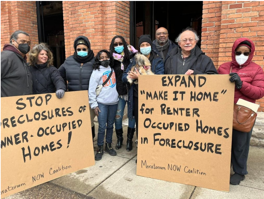
Detroit Moratorium NOW! Coalition demonstration outside Wayne County Treasurer on March 30, 2022

Activists gathered outside at 400 Monroe, the Wayne County Treasurer, on March 30 welcoming the extension of the halt to foreclosures and auctions of owner-occupied homes, however, emphasizing that renters and those owing taxes prior to 2017, are also in dire need of protection from homelessness. Auctioning of owner-occupied homes among other properties in Detroit has not resulted in any revitalization of neighborhoods where people are still leaving in the thousands every year.