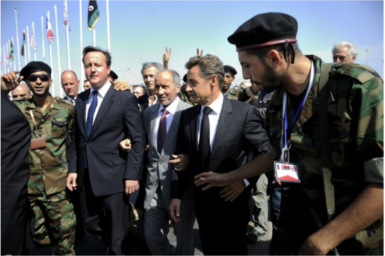
British Prime Minister David Cameron, Libya's "President" Mustafa Abdul Jalil, French President Nicolas Sarkozy and French author Bernard-Henri Levy (behind) are accompanied by NATO's mercenary-terrorists, Tripoli, 15 September 2011