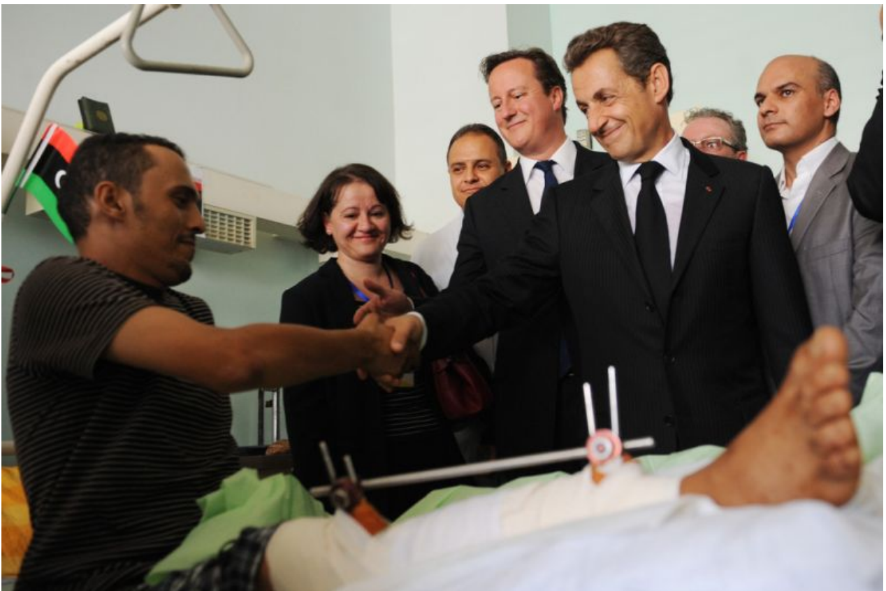
French President Nicolas Sarkozy and British Prime Minister David Cameron shake hands with a wounded NATO mercenary-terrorist, Tripoli Medical Centre, 15 September 2011