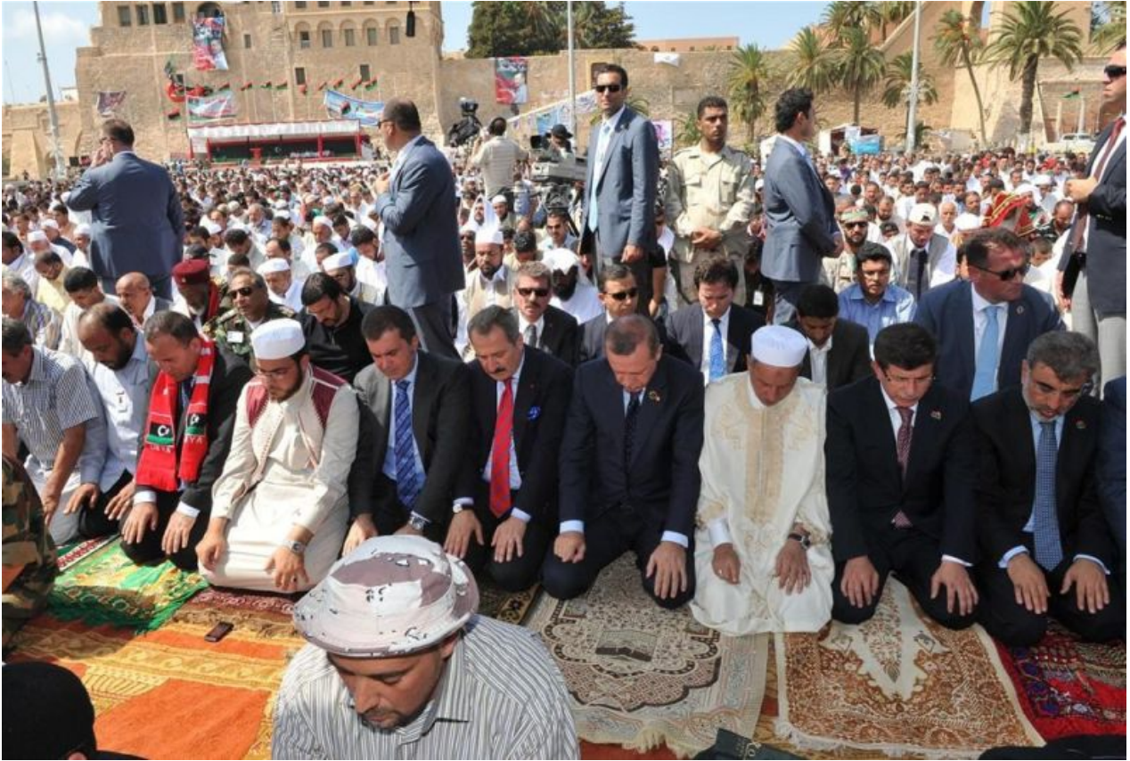
Libya's "President" Mustafa Abdul Jalil, Turkey's Prime Minister Recep Tayyip Erdogan, Foreign Minister Ahmet Davutoglu, Deputy Prime Minister Bekir Bozdag, Energy Minister Taner Yildiz, Economy Minister Zafer Caglayan attend Friday prayers, Green Square, Tripoli, 16 September 2011. Turkey's Defense Minister Ismet Yilmaz and Minister of Transport Binali Yildirim [not seen in this photo] are also present.