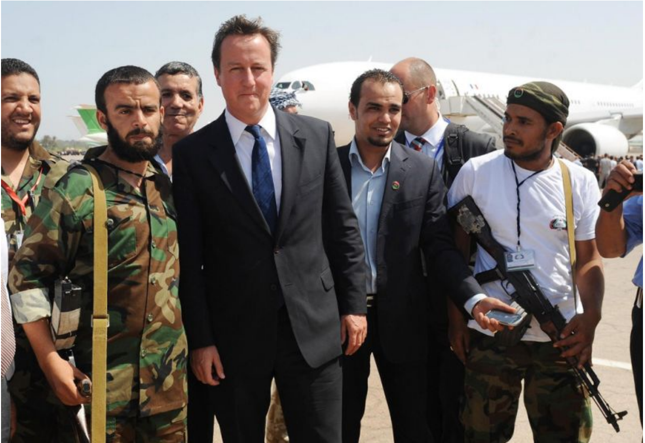
British Prime Minister David Cameron poses with NATO's mercenary-terrorists, Benghazi Airport, 15 September 2011