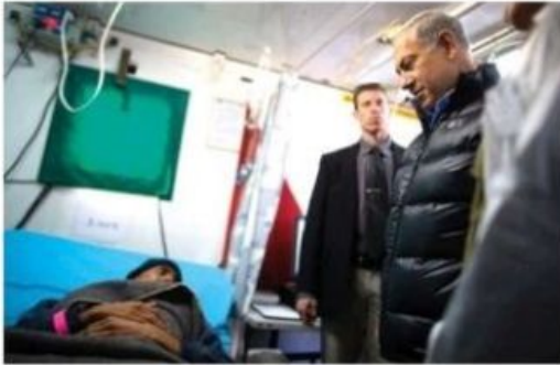
PRIME MINISTER Benjamin Netanyahu speaks to a Syrian man who was wounded in the civil war, during his visit to a military hospital on the Golan Heights yesterday.