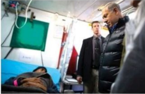
PRIME MINISTER Benjamin Netanyahu speaks to a Syrian man who was wounded in the civil war, during his visit to a military hospital on the Golan Heights yesterday.