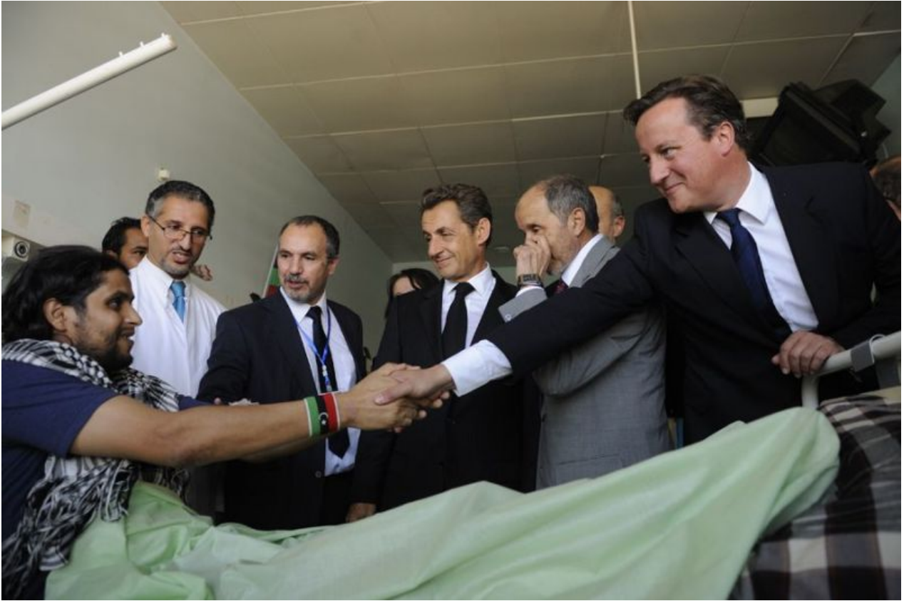
British Prime Minister David Cameron shakes hands with a wounded NATO mercenary-terrorist as French President Nicolas Sarkozy and Libya's "President" Mustafa Abdul Jalil stand aside, Tripoli Medical Centre, 15 September 2011