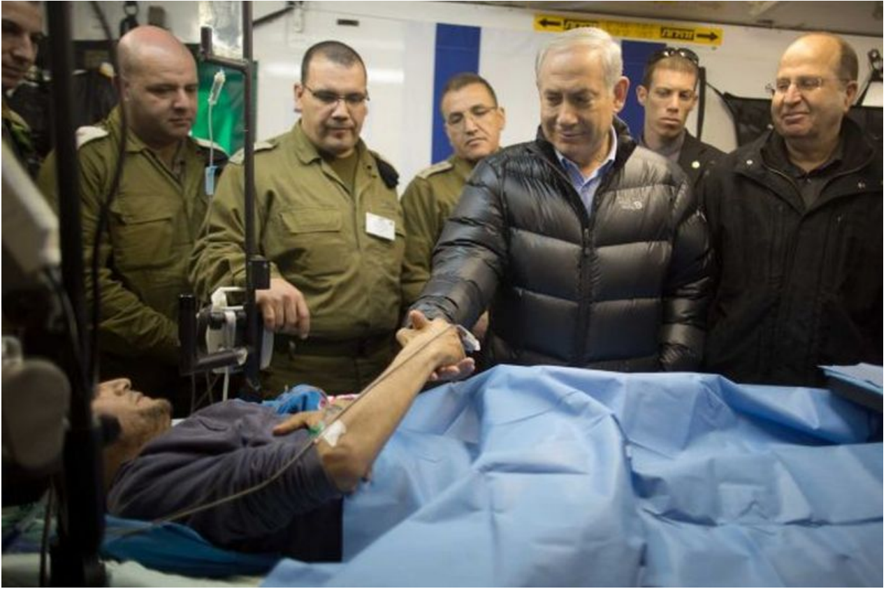
Israeli Prime Minister Benjamin Netanyahu shakes hands with a wounded mercenary-terrorist, Israeli military field hospital in the occupied Golan near Israel's border with Syria, 18 February 2014

Israeli Defence Minister Moshe Ya'alon stands aside.