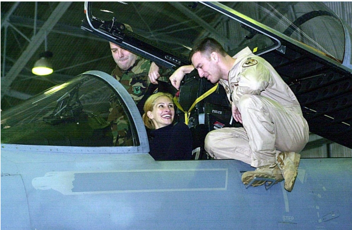
Actress Julia Roberts sits in the cockpit of an F-15 fighter jet, NATO's Incirlik Airbase, Turkey, 7 December 2001