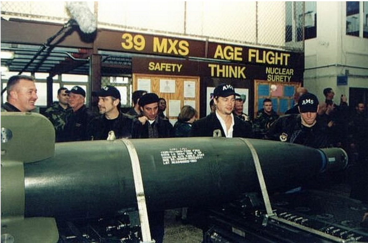
Actors George Clooney, Andy Garcia, Brad Pitt and Matt Damon tour the 39th Air Base Wing of the United States Air Forces (USAF) at NATO's Incirlik Airbase, Turkey, 7 December 2001. Incirlik Airbase hosts the largest US nuclear arsenal outside the United States: some 90 thermo-nuclear B61 bombs. [3]