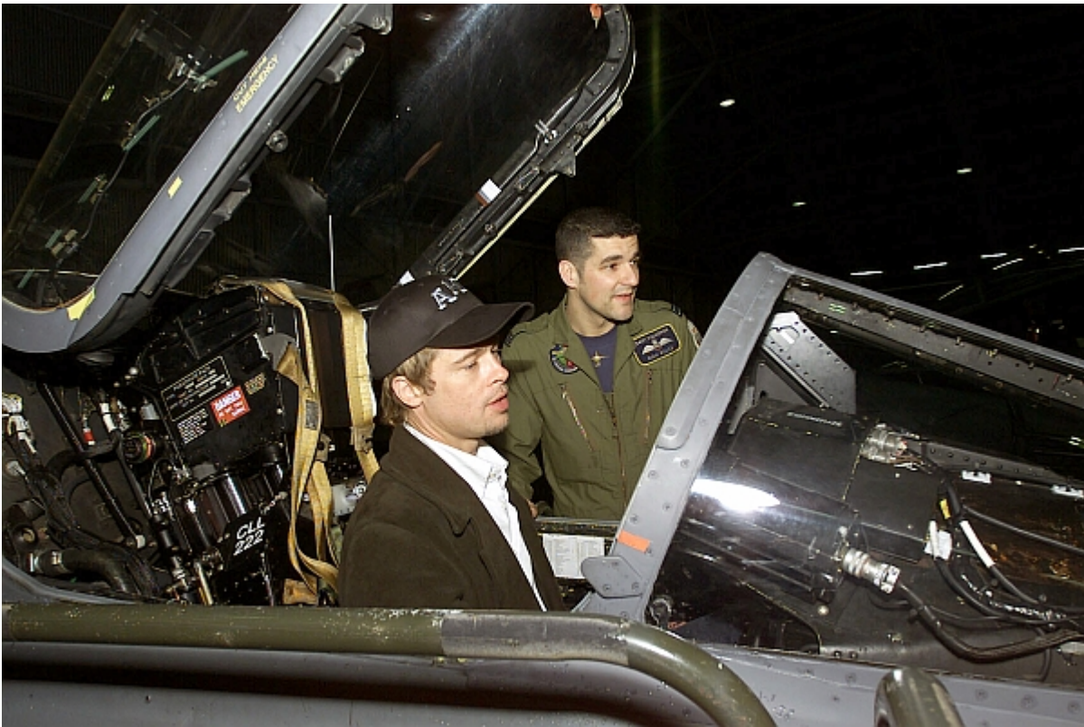
Actor Brad Pitt [2] sits in the cockpit of a UK Royal Air Force (RAF) GR3A Jaguar fighter jet, NATO's Incirlik Airbase, Turkey, 7 December 2001