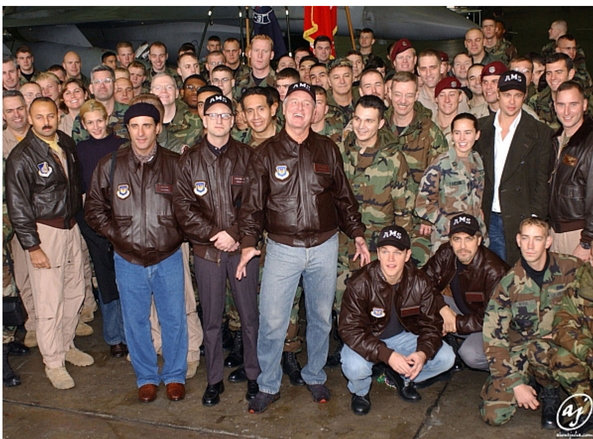
"Ocean's Eleven" cast members pose with U.S. troops at NATO's Incirlik Airbase, Turkey, 7 December 2001. From left centre, standing, are Julia Roberts, Andy Garcia, director Steven Soderbergh, producer Jerry Weintraub and, kneeling, Matt Damon and George Clooney, and Brad Pitt, standing. Most of them are wearing leather flight jackets of the United States Air Forces in Europe (USAFE).

"George [Bush] jumped up and said 'great' and everyone came on board." [II]