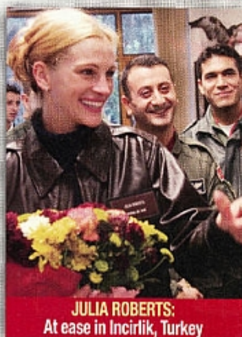
JULIA ROBERTS: At ease in Incirlik, Turkey