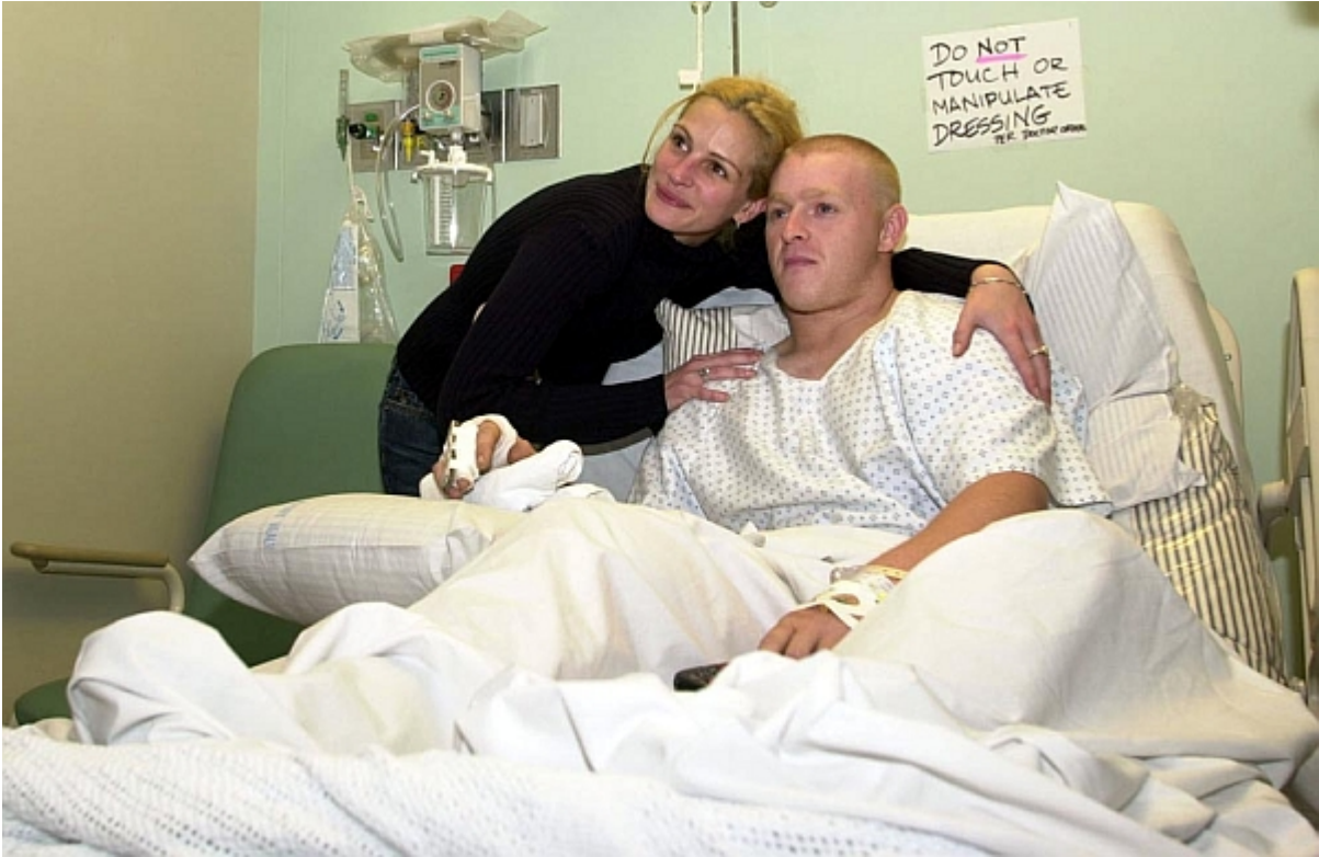
Actress Julia Roberts poses with a wounded soldier at the military hospital in NATO's Incirlik Airbase, Turkey, 7 December 2001