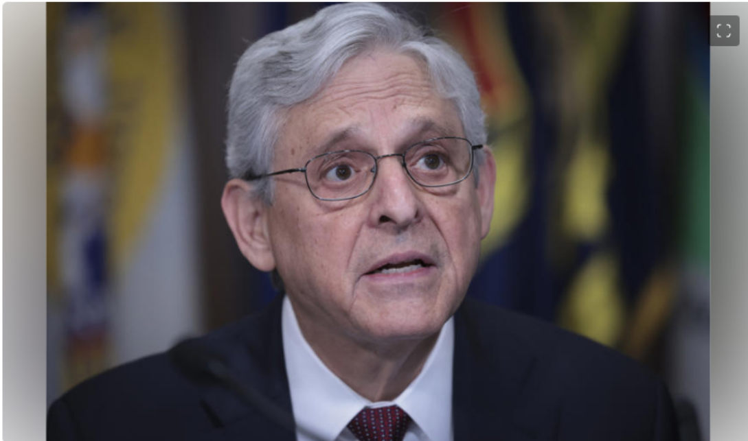
Attorney General Merrick Garland delivers remarks about Justice Department efforts to combat crime on January 5, 2024 in Washington, D.C. Garland faced criticism from conservatives after saying he believes former President Donald Trump should have a "speedy trial" in the federal election interference case.