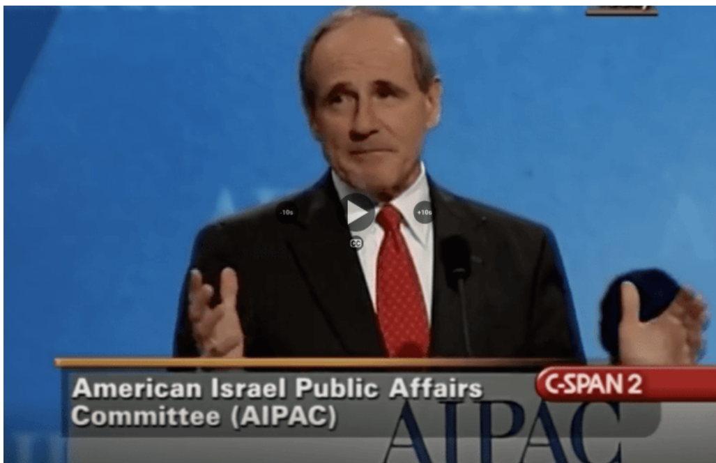
Image from video of Risch's speech at AIPAC convention; view it here .

The chairman is Sen. Jim Risch , R-Idaho. According to Open Secrets , one of Risch's main sources of campaign donations is the pro-Israel lobby.