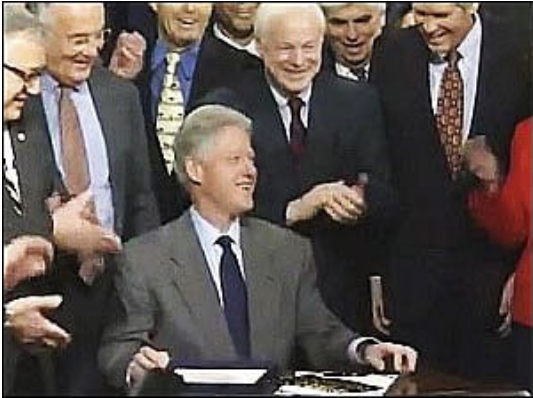
President Bill Clinton Laughs It Up as He Signs the Repeal of the Glass-Steagall Act. November 12 1999. Financial Services Modernization Act

One of the most famous derivatives in the era of the financial crash of 2007-2010 was described as mortgaged-backed securities. On the surface these bundles of debt-burdened properties might seem easy to understand. But that would be a delusion. The value of these products was affected, for instance, by unpredictable shifts in interest rates, liar loans extended to homebuyers who lacked the capacity to make regular mortgage payments, and significant shifts in the value of real estate.