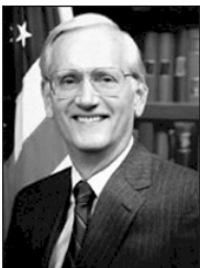
William S. Sessions FBI Director November 2, 1987 - July 19, 1993