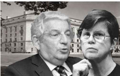
Justice Minister David Libai and AG Janet Reno

Fire "wrong-doers" but continue activities