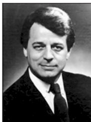
Floyd I. Clarke Acting Director July 19, 1993 - September 1, 1993