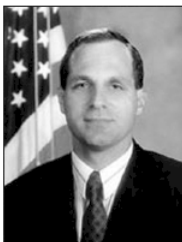
Louis J. Freeh Director September 1, 1993 - June 25, 2001