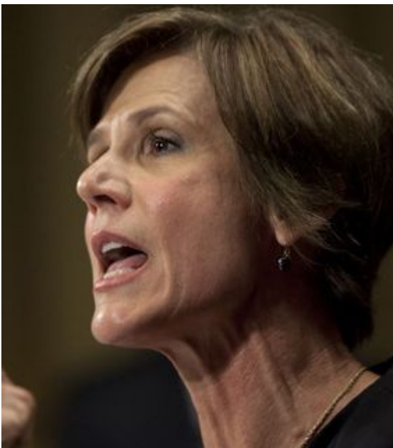
Image: Deputy Attorney General Sally Yates

None of these assertions should be accepted at face value. For 15 years, the threat of imminent terrorist violence has been used by the US government to bully the public and justify a sustained assault on democratic rights. Meanwhile, the relationship of the same state agencies demanding anti-democratic measures to those who have actually carried out terrorist attacks—from 9/11 to the Boston marathon bombing—has never been seriously investigated.