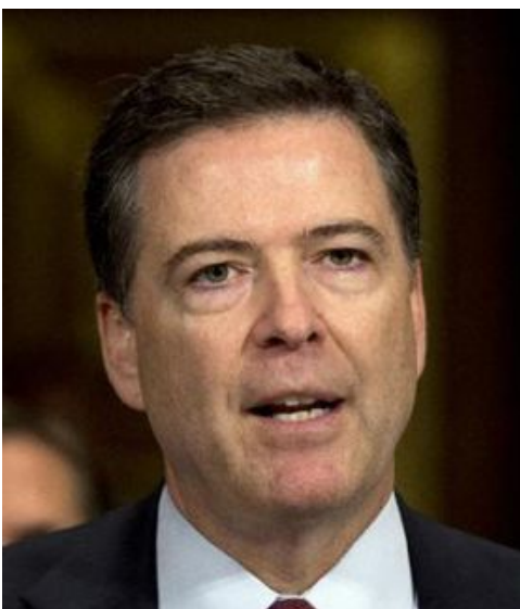
Image: FBI Director James B. Comey

In his joint statement with Yates to the Senate Judiciary Committee, Comey said, “Our goal at the Department is to work collaboratively and in good faith with interested stakeholders to explore approaches that protect the integrity of technology and promote strong encryption to protect privacy, while still allowing lawful access to information in order to protect public safety and national security.” In other words, the FBI and Obama administration want to establish a legal and technical framework—with the support of Congress and powerful corporate interests—to further undermine democratic rights by breaking into widely used security methods with special access technologies.