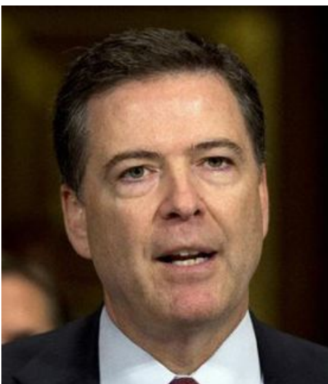
Image: FBI Director James B. Comey

In his joint statement with Yates to the Senate Judiciary Committee, Comey said, “Our goal at the Department is to work collaboratively and in good faith with interested stakeholders to explore approaches that protect the integrity of technology and promote strong encryption to protect privacy, while still allowing lawful access to information in order to protect public safety and national security.” In other words, the FBI and Obama administration want to establish a legal and technical framework—with the support of Congress and powerful corporate interests—to further undermine democratic rights by breaking into widely used security methods with special access technologies.