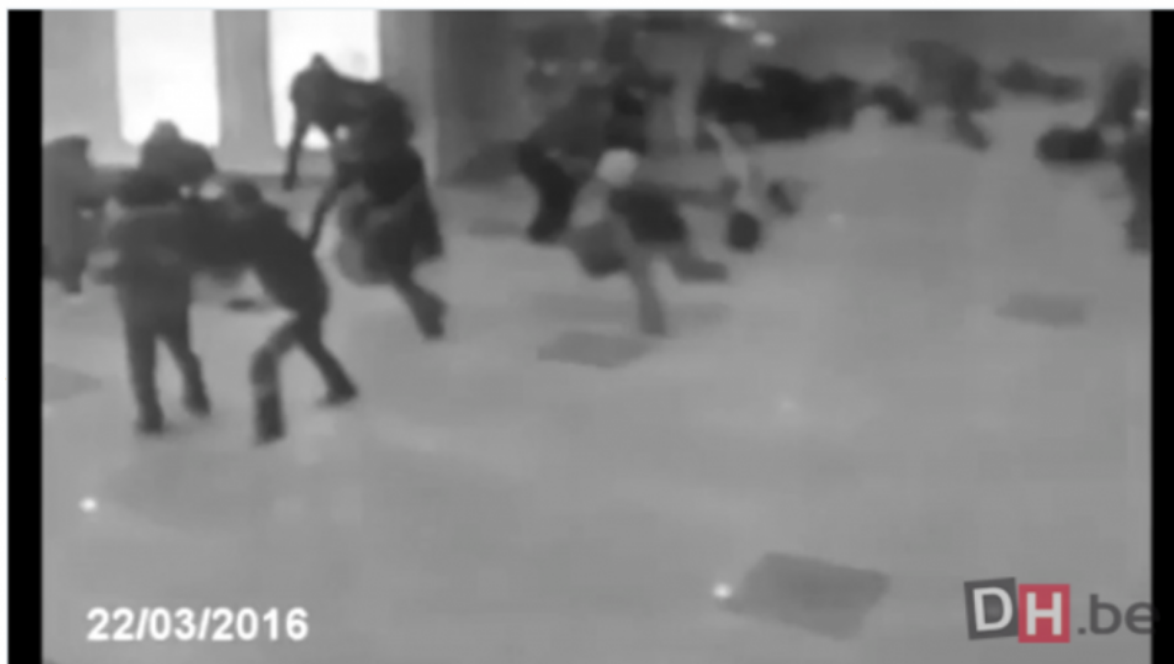
Vidéo de surveillance au moment d'une des explosions à l'aéroport -... Vidéo de surveillance au moment d'une des explosions à l'aéroport

And the screenshot of La Libre at http://lalibre.be ,