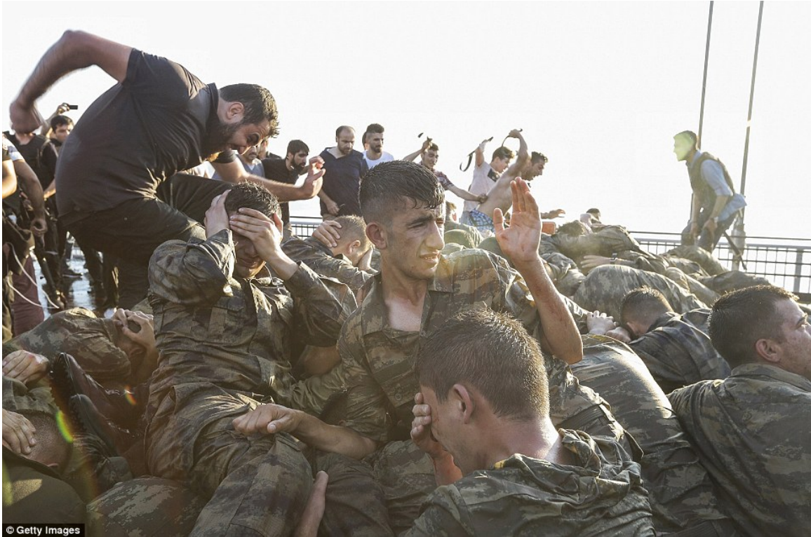
Soldiers surrendering, beaten up by supporters of Erdogan

Combining the previous points with a simplistic explanation that Erdogan would have foiled a CIA coup organized by Gülen for his recent change of opinions on Syria and Putin is wrong, in my view, for the following reasons: