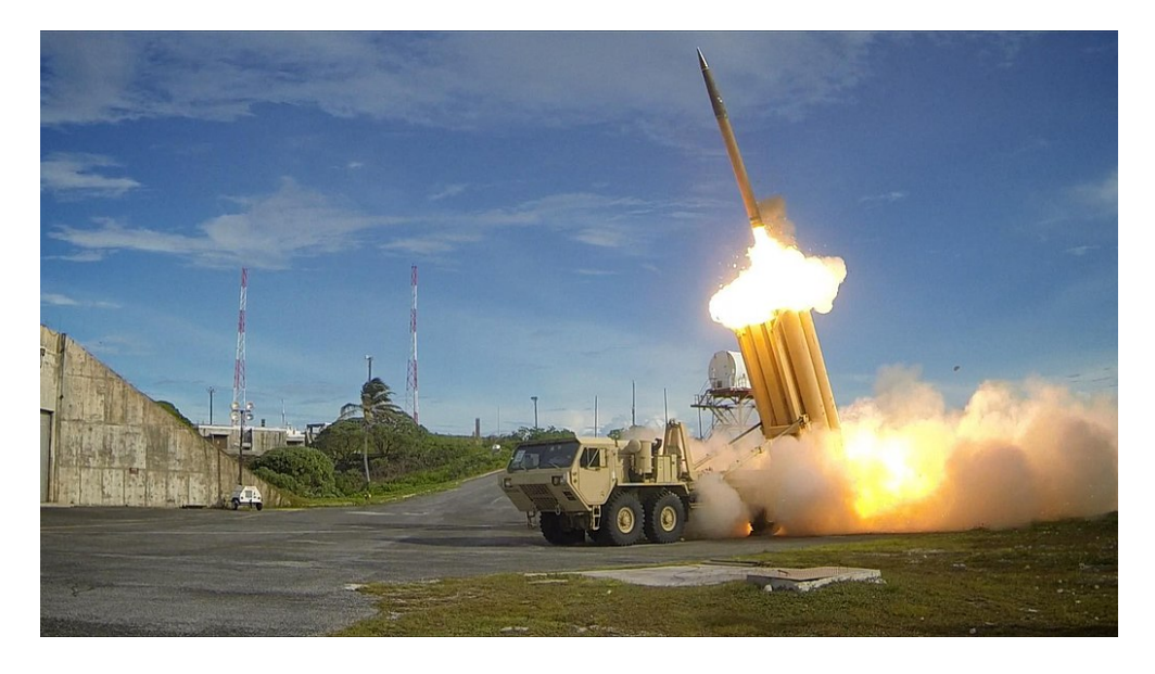
The first of two Terminal High Altitude Area Defense (THAAD) interceptors is launched during a successful intercept test.

"The Democratic People's Republic of Korea has clarified more than once that it would feel no need to possess even a single nuclear weapon once it was no longer exposed to the United States' threat and after that country had dropped its hostile policy towards the DPRK and confidence had been built between the two countries."