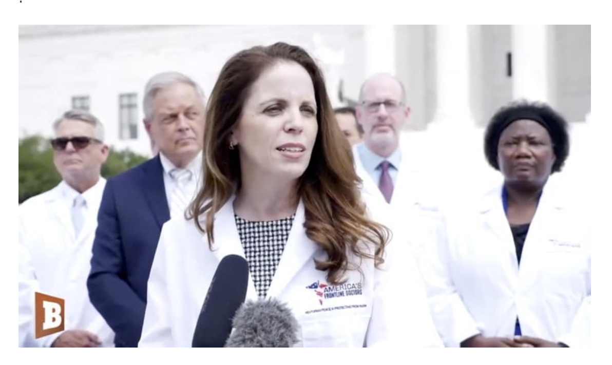
Watch the video here.

The press conference featured Rep. Ralph Norman (R-SC) and <u>frontline doctors</u> sharing their views and opinions on coronavirus and the medical response to the pandemic. YouTube (which is owned by Google) and Twitter subsequently removed footage of the press conference as well.