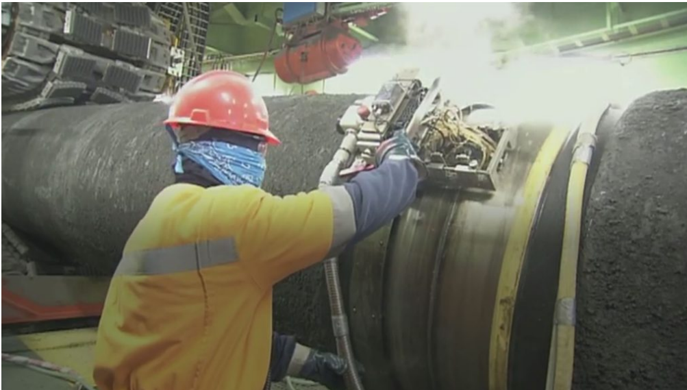
A worker testing part of the Nord Stream pipelines

It would be extremely difficult for a small ragtag “pro-Ukrainian group” to sabotage these pipelines. The attack clearly involved a lot of planning and resources, which suggests that a state was very likely involved.