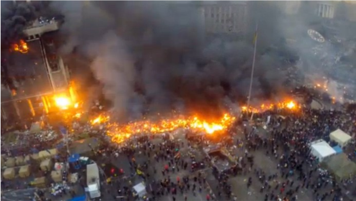
Aerial view of Maidan square protests that resulted in Yanukovich's ouster.

The U.S. has since provided extensive military aid and training to Ukrainian armed forces as they brutalized the people of Eastern Ukraine who voted to secede after the 2014 coup.