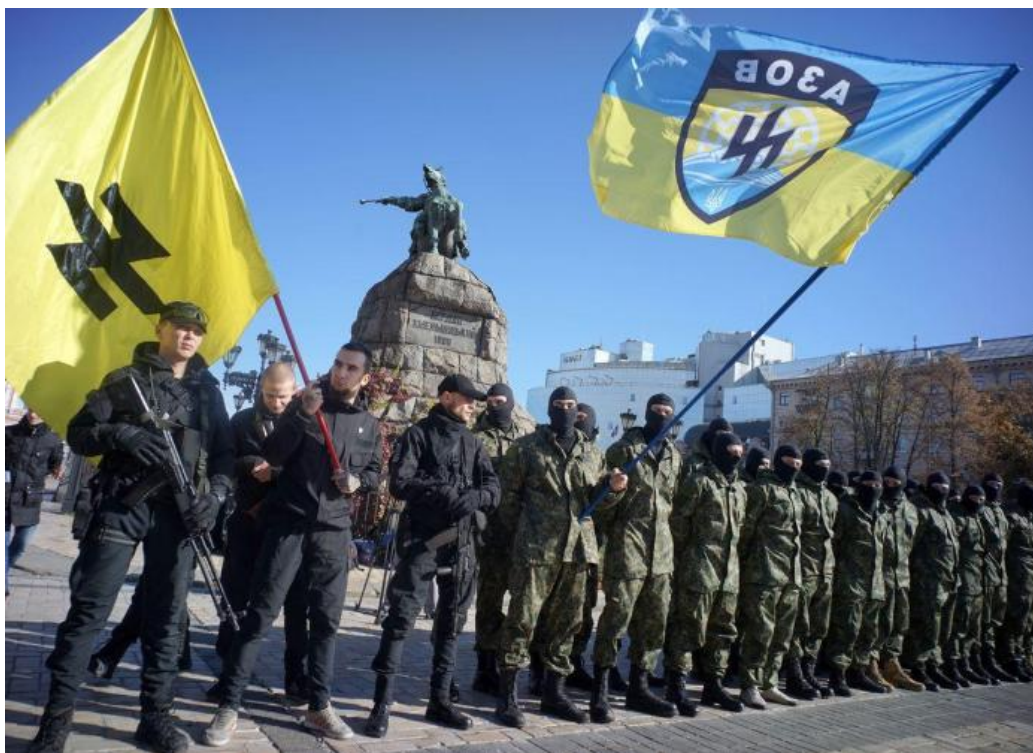
Members of the Azov battalion in Kiev.

that Putin, in his speech relating to the recognition of the Donbass republics, does point out that Kyiv has been constantly attacking innocent civilians in that region since 2014.)