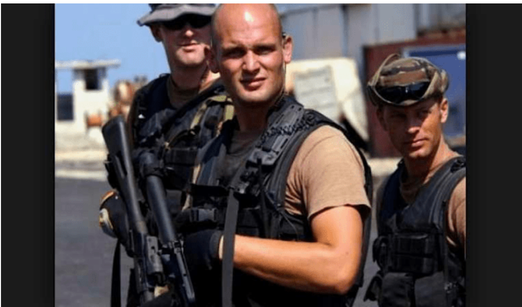
American mercenary in Donbass

Russia reported on Monday that it had captured a Ukrainian soldier and killed five others after they crossed into Russian territory in Rostov , just over the border with Ukraine. Several hundred American mercenaries were also reported to have arrived in Ukraine in the last week.