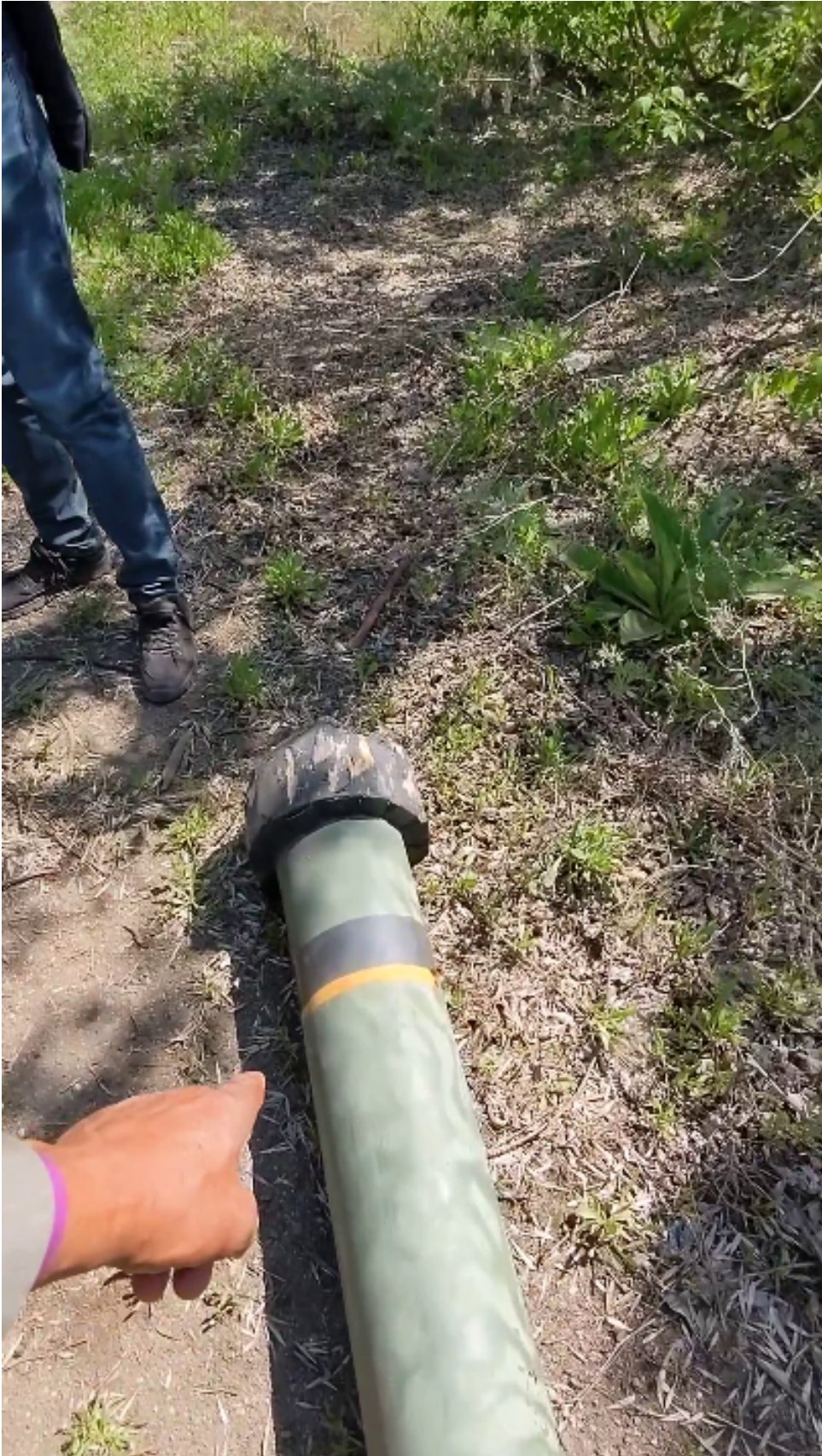
My photo of a decoy surface-to-air missile weapon by a bunker near Sokilnyky.