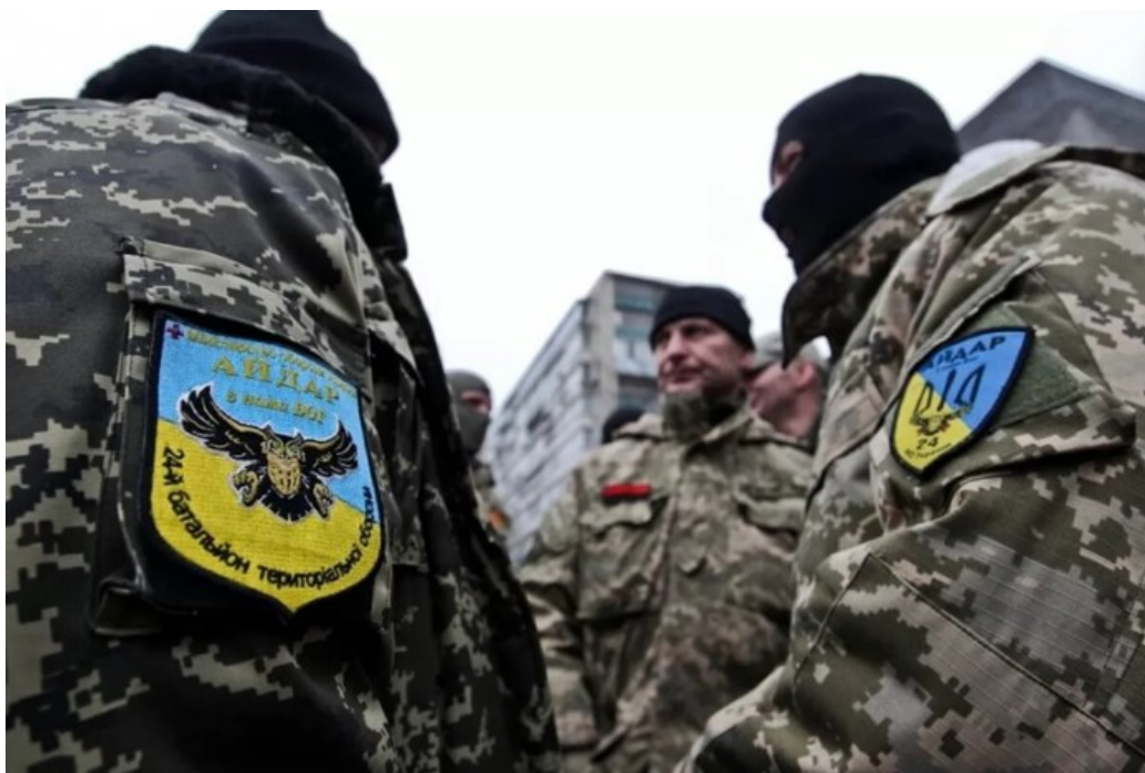
Members of Pro-Nazi Aidar Battalion who are hated by the people of eastern Ukraine.

I then approached a few elderly women sitting on a bench. I asked about the situation here under Ukrainian military occupation. They all described the military as being led by the Aidar Battalion, which they could tell by the colors of their patches and Nazi symbols they wore.