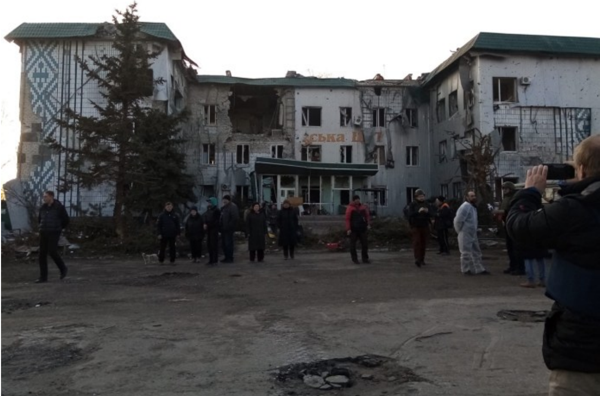
The destroyed hospital in Volnovakha and delivery of humanitarian aid.