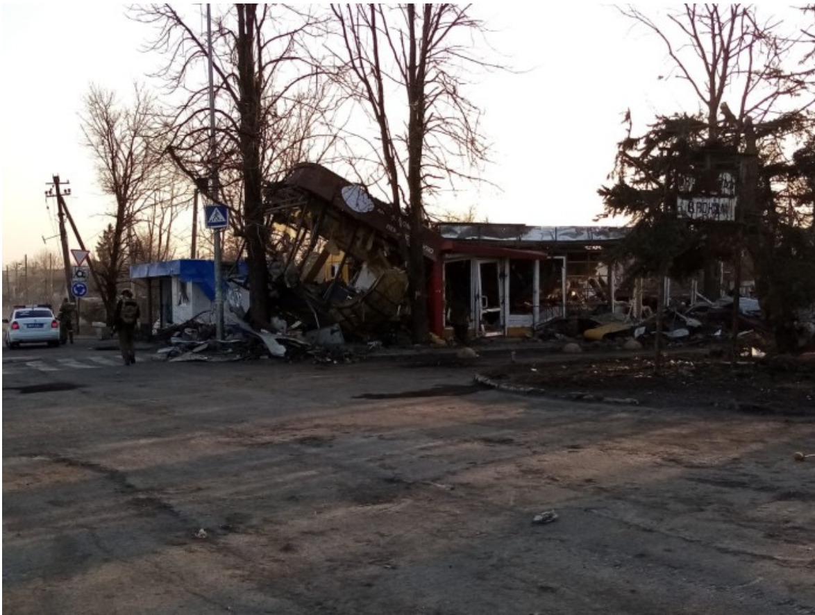
The destroyed city of Volnovakha in eastern Ukraine.

had only been liberated a few days ago. The Ukrainian army in collaboration with Nazi battalions has wreaked havoc in the city during its withdrawal. Nearly all the buildings had been shot down or destroyed by rocket attacks.