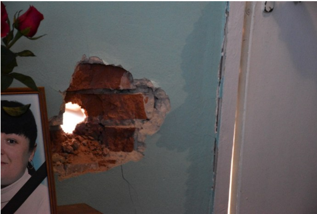
Residue from missile strike in home on Donetsk.

These human rights organizations only report if it is in their own interest, that is, if their Western donors instruct them to report on it. The monument was at the city park of Donetsk and from there we could hear the aerial sounds of attacks, either from the Ukrainian or Russian army, because Mariupol is not very far away from Donetsk.