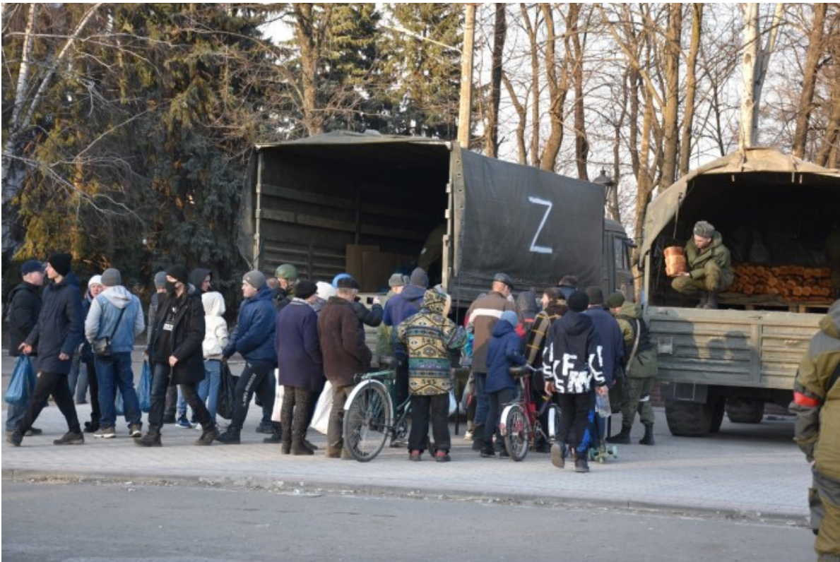
Russian soldiers delivering humanitarian relief.

The Russians delivered humanitarian aid to the people who still lived there and had nothing. Of course, the delivery of humanitarian aid is not mentioned in Western media outlets. But in every liberated town or village I went to, the Russian army was delivering aid to the people who suffered immensely.