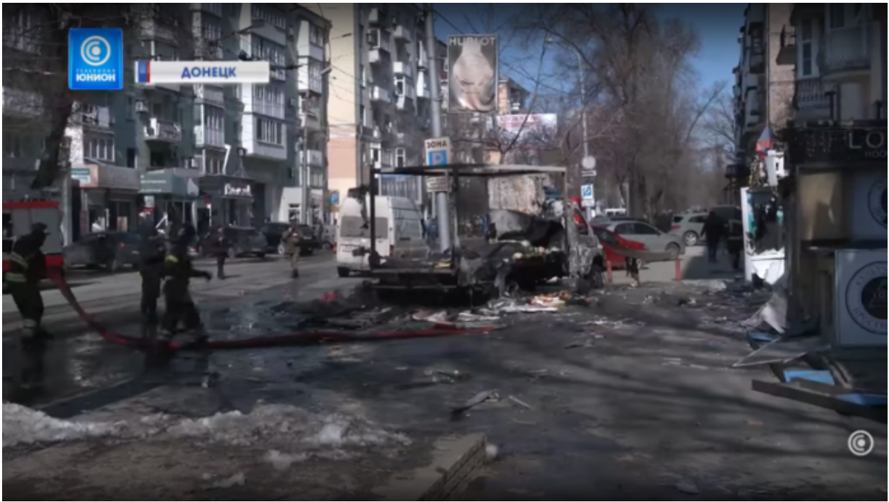
Macabre scene after rocket attack on March 15 by the Ukrainian army in Donetsk.

“People were waiting in line near an ATM and were standing at a bus stop,” Denis Pushilin said, “There were children among the dead.” Pushilin added that the casualty count would have been much higher had the rocket not been downed.”