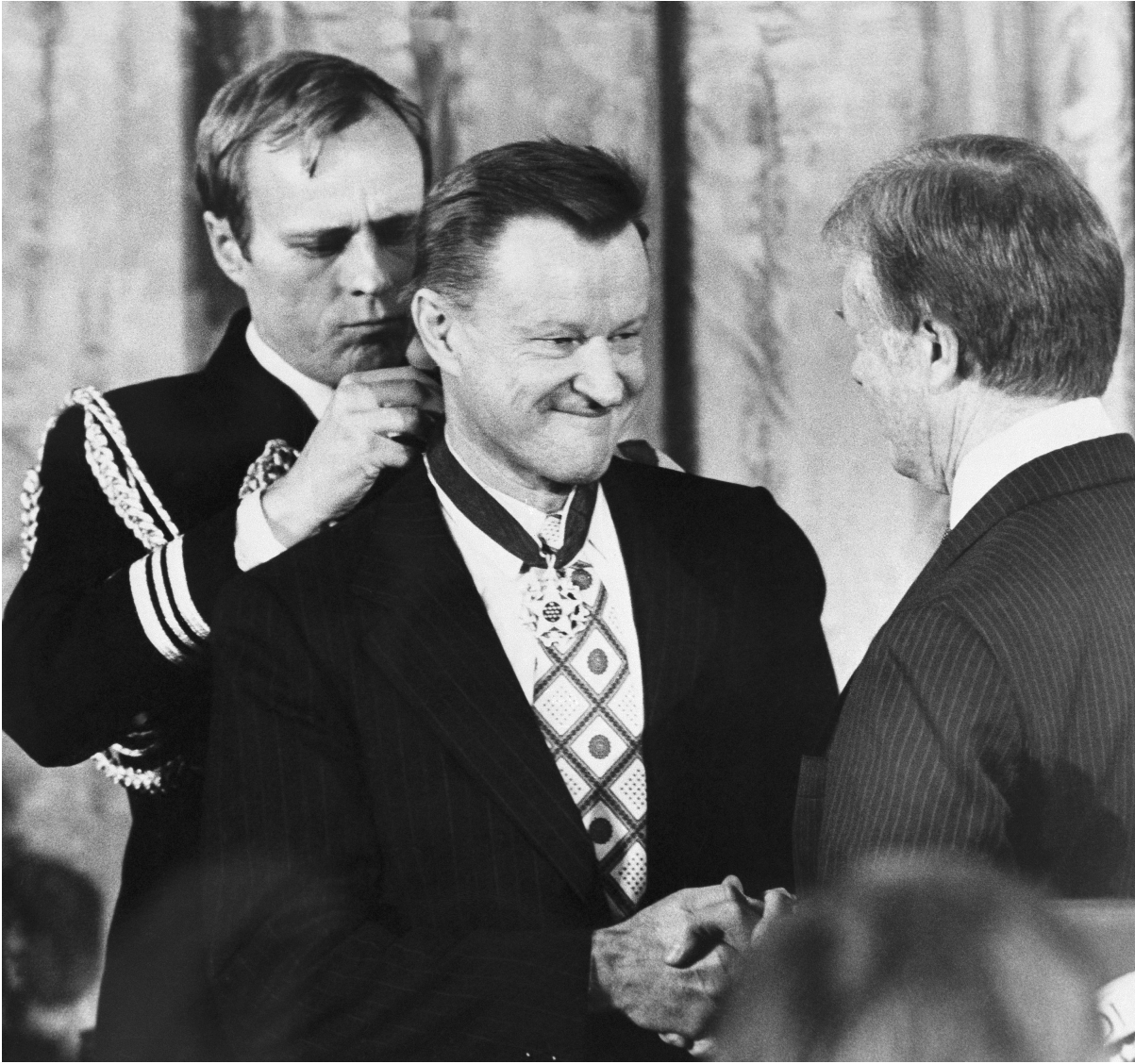
Brzezinski was awarded the Presidential Medal of Freedom in 1981

Brzezinski was awarded the Presidential Medal of Freedom in 1981, and continued to play a prominent role in setting U.S. foreign policy during the Reagan administration. During this period, the U.S. continued Carter's Afghan policy, and also supported the violent insurgents who battled against the Sandinistas. U.S.-aligned media portrayed the CIA-trained forces in Nicaragua as "freedom fighters" as they slaughtered entire villages . Saudi Arabia again functioned as the "middle man," transferring money and weapons to U.S.-aligned anti-government fighters in Nicaragua.