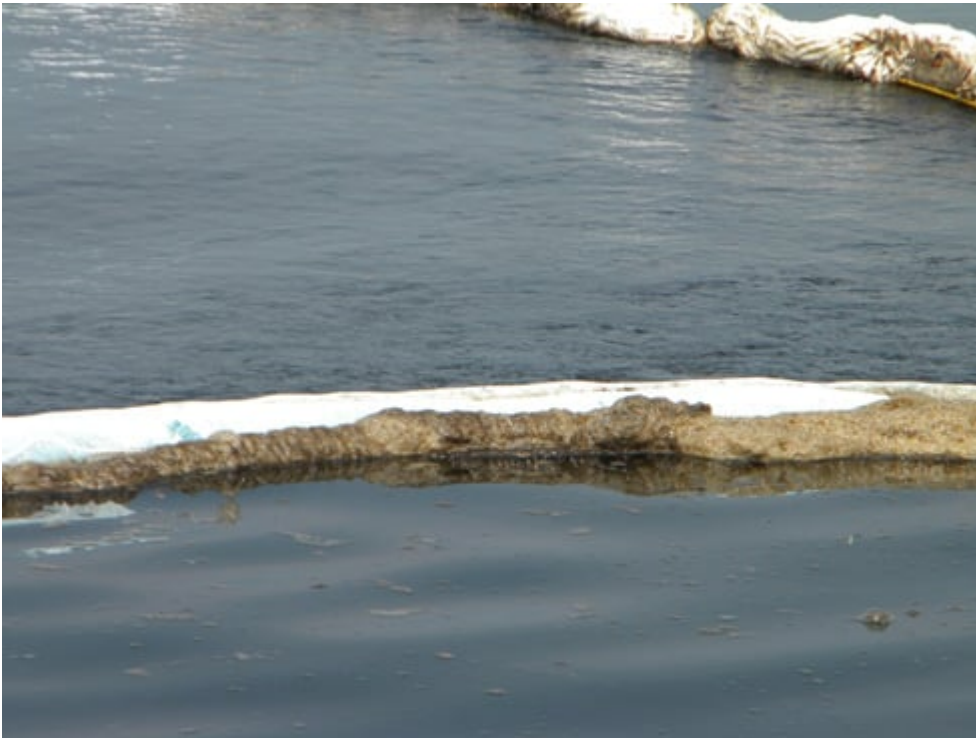
Oiled boom, August 5, 2010.

the Pass Harbor. The water looked black in places. Lots of bubbles, not foam, just bubbles. Around 8:30, we were in oil sheen and mousse and were told to drop the boom. The more we pulled the boom, it appeared the more was coming up. The Pass [Christian] Harbor was closed because the oil was coming in so bad. We pulled boom back and forth the rest of the afternoon.”