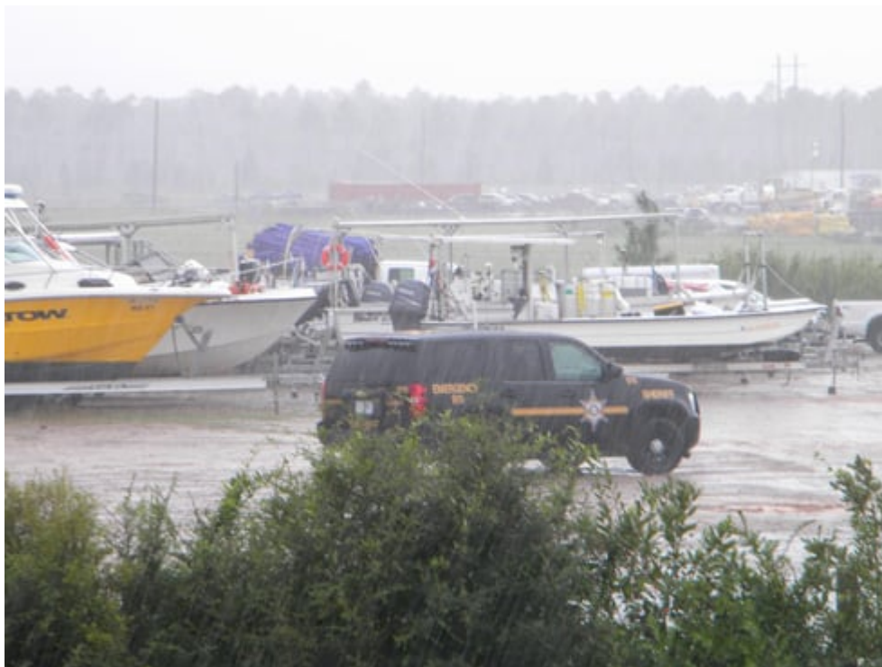
Corner of Canal Road and I-10, in Gulfport, Mississippi, at the Gulfport site used as a BP staging area, August 14, 2010.

"There were probably more boats there than in the entire Pass [Christian] VOO program at the time," reads her entry. "There were only a couple of regular skimmer boats. All appeared to have Louisiana registrations. Almost all of the skiffs had the white tanks on them. A few of the tanks looked like they could have had something in them at one time, but nothing like the oily, sticky mess we had been dealing with. If we got something on our boat, it was almost impossible to get it off. I don't see how they could have gotten it out of the tanks and still looked like they did. Also, there was a Harrison County Sheriffs Department car, right by the boats and some large, plastic, white containers with yellow bases."