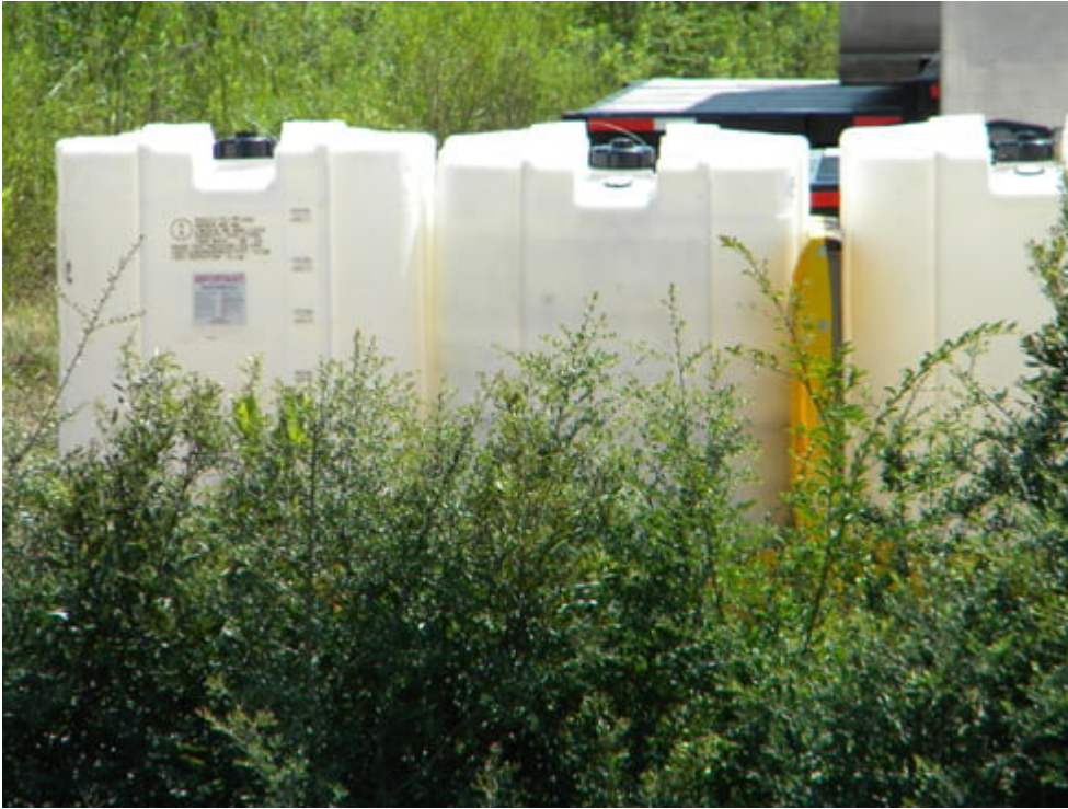
Corexit tanks, September 1, 2010.

Her August 16 entry details her discovery: