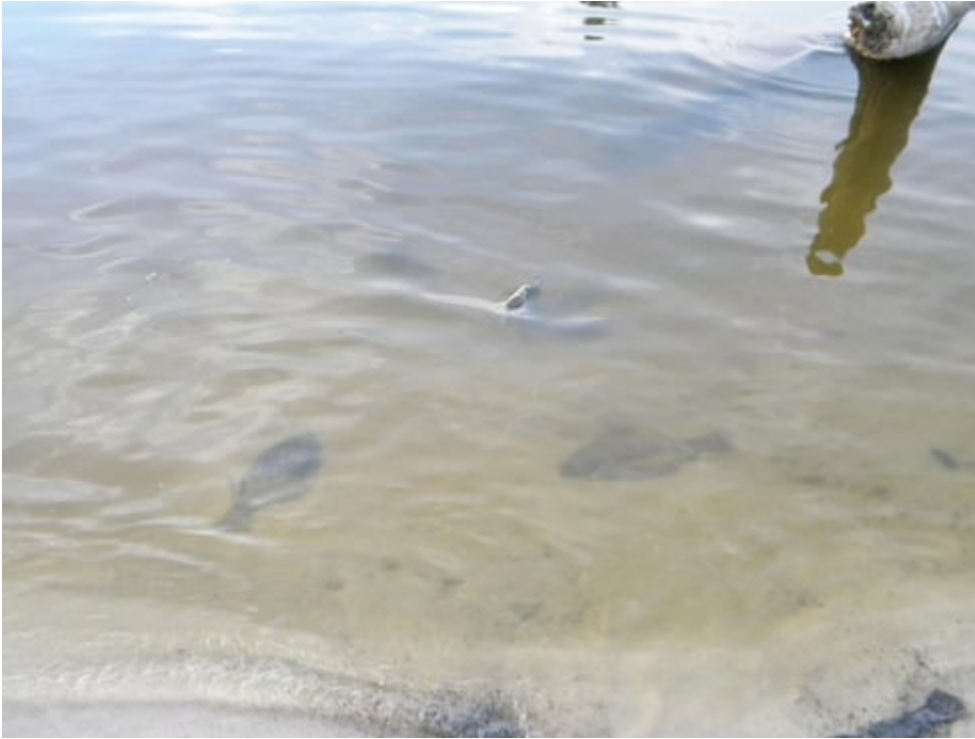
Dead flounder among fish kill, August 6, 2010.