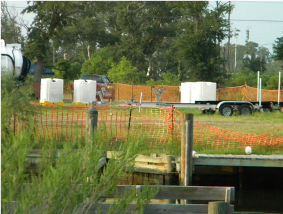
Corner of Canal Road and I-10, in Gulfport, at the Gulfport site used as a BP staging area.

Other reports, of a very similar nature, have been reported about other BP staging areas along the Gulf of Mexico. The tanks are clearly used to store and transport Corexit dispersant. The Carolina Skiffs are clearly used to spray it atop oil.