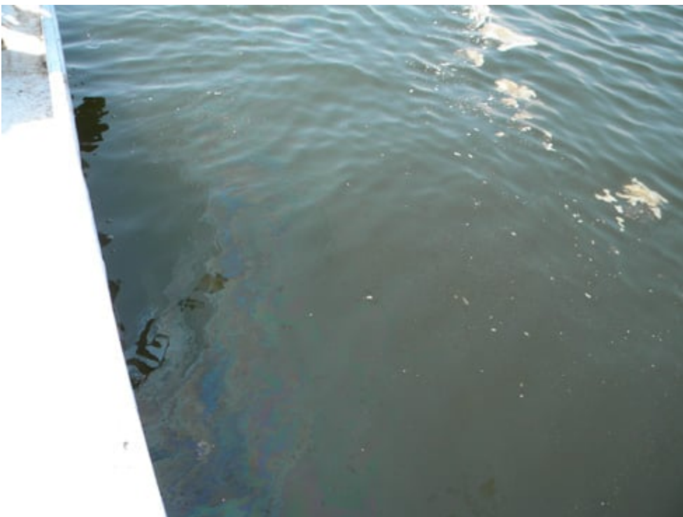
Oil sheen and dispersant remnant, August 1, 2010.