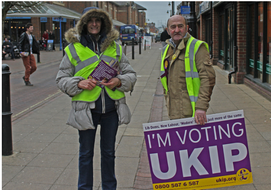
UKIP supporters in 2013.