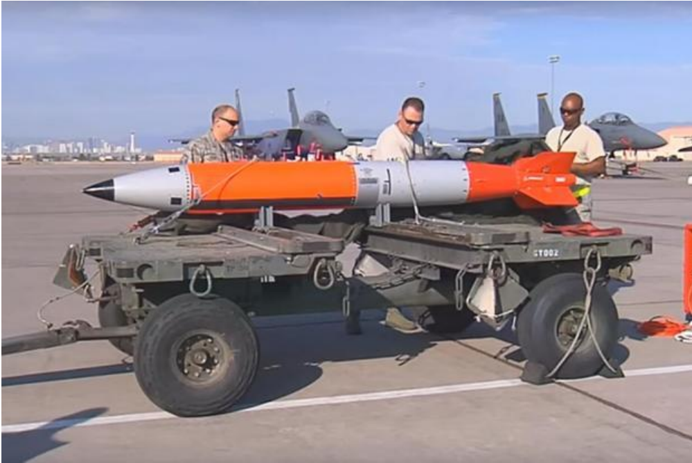
B61-12 guided nuclear bomb (Screengrab from a US Air Force video)