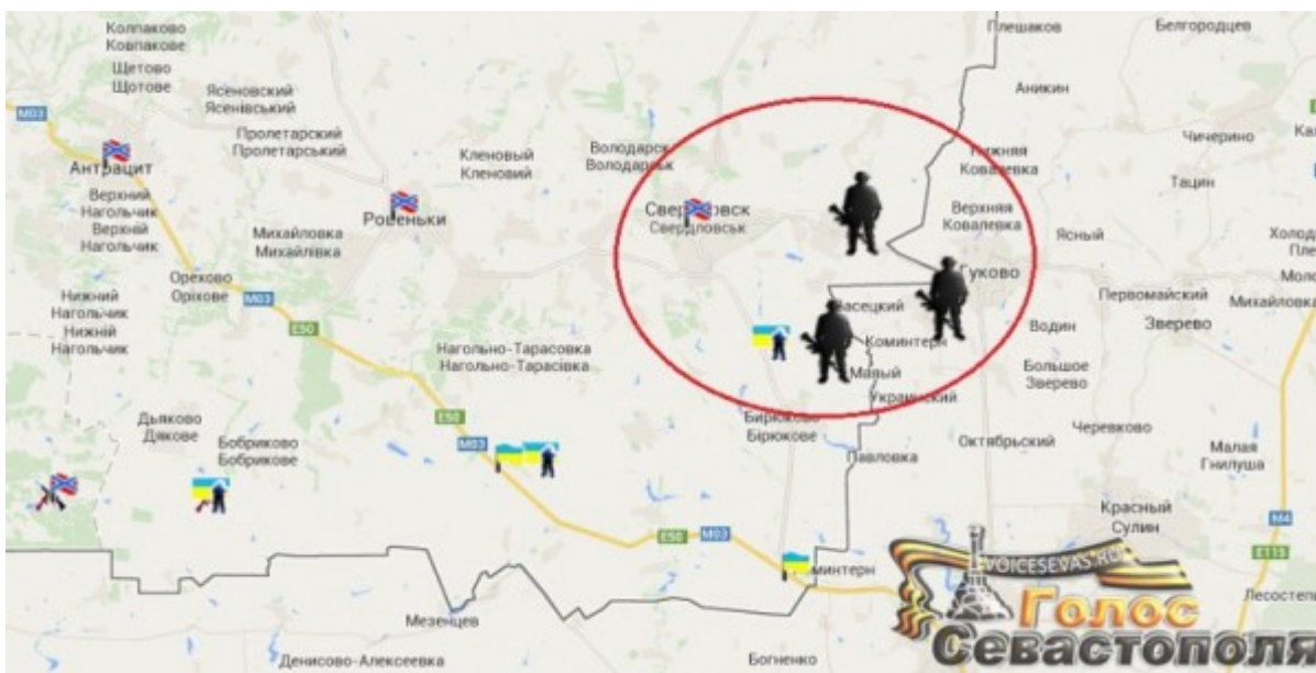
Map: Operational information from Colonel Cassad LiveJournal

Four hundred and thirty eight Ukrainian servicemen have requested asylum in Russia and moved into the Russian territory. According to ITAR-TASS, this was announced by the Border Guard department of the Federal Security Service ("FSB") of Russia.