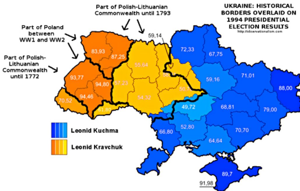
Electoral Map of Ukraine’s 1994 Presidential Election:

Essentially, the same radical split in the electorate occurred election after election. During the last legitimate election held within the old communist borders of the country during 2010, the above pattern was replicated. This time Kuchma’s protégé, Viktor Yanukovich, won the election by a hair by virtue of lopsided margins in the historic Russian-speaking territories of the east and south (blue areas of the map).