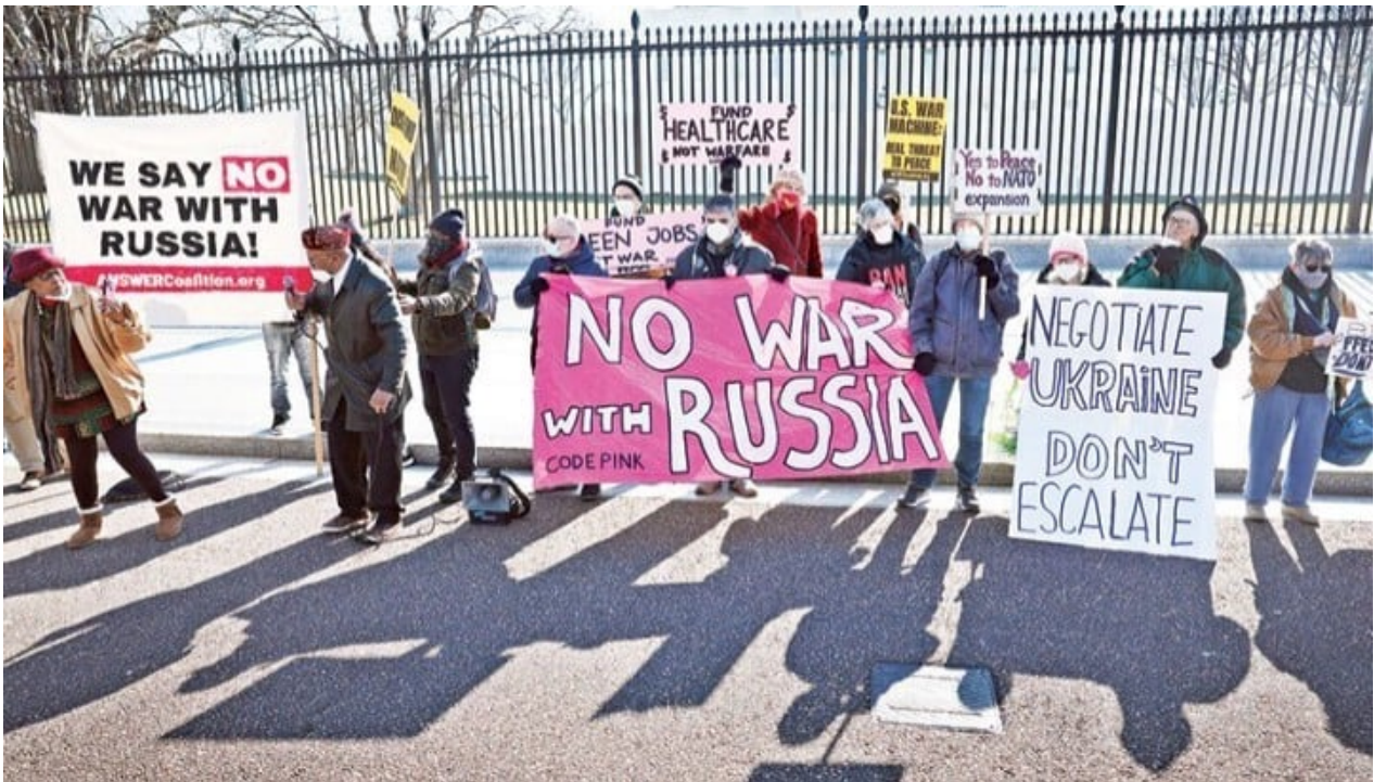
CODEPINK "No War with Russia Rally, Negotiate Ukraine, Don't Escalate." (2022)

U.S. peace activists are calling for the United States to play an active role in de-escalating the Russia-Ukraine war, given the nuclear threat and the war's immense human toll. The tactics range from brokering a ceasefire to bringing both sides to the negotiating table to address grievances, including the ways the United States has encouraged the expansion of NATO since the end of the Cold War.