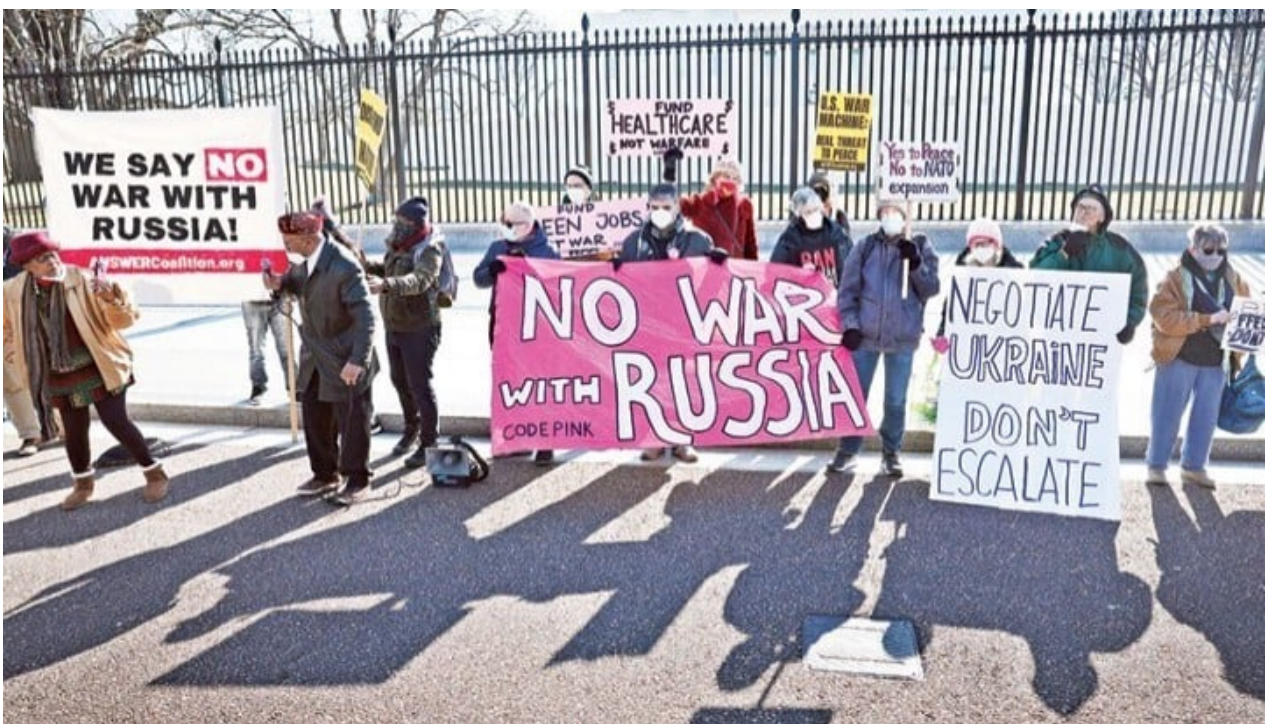
CODEPINK "No War with Russia Rally, Negotiate Ukraine, Don't Escalate." (2022)

U.S. peace activists are calling for the United States to play an active role in de-escalating the Russia-Ukraine war, given the nuclear threat and the war's immense human toll. The tactics range from brokering a ceasefire to bringing both sides to the negotiating table to address grievances, including the ways the United States has encouraged the expansion of NATO since the end of the Cold War.