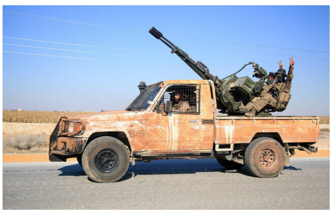
Anti-government fighters ride military vehicles as they drive along a road in the eastern part of Aleppo province on December 1, 2024.

In fact Israeli media is giving a lot more truth about the Syrian rebel forces than British and American media just now. This is <u>another article</u> from the Times of Israel: