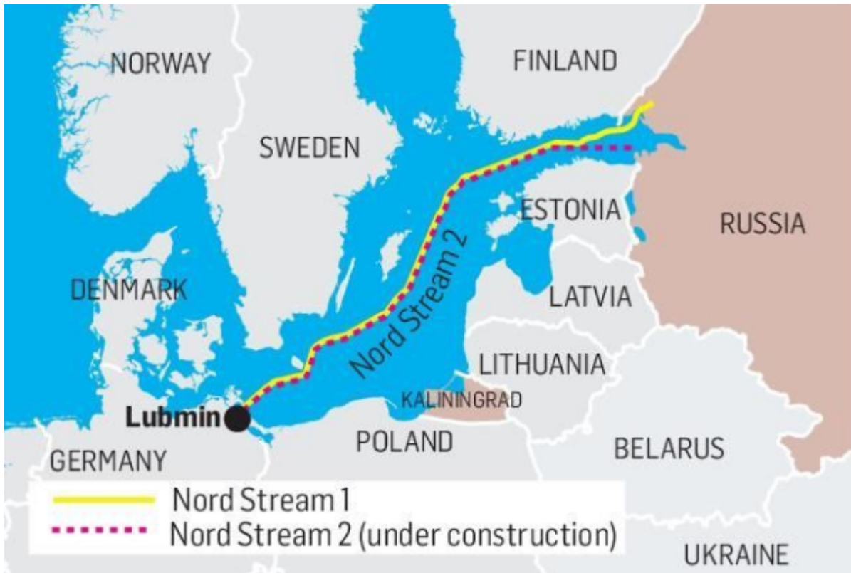
Map of Nord Stream 1 and 2

But Hersh's account omits some important details. Ordered by Washington, Germany had canceled finalizing Nord Stream Pipeline 2 way before the undersea gas-ducts were blown up. At that time, international gas prices rose by 8%, since the world at large was thirsty for the now "freed" Russian gas. So, Russia had no shortage of demand.