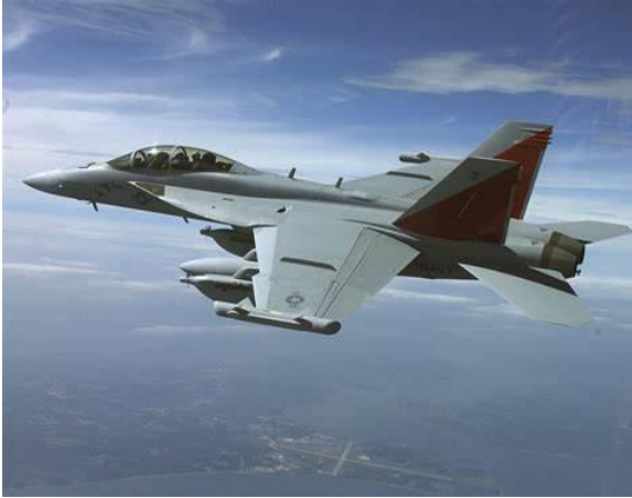
Image: Boeing EA-18G Growler.

Sea Breeze, according to Madsen, included the AEGIS-class guided missile cruiser USS Vela Gulf . From the Black Sea, “the Vela Gulf was able to track Malaysia Airlines MH17 over the Black Sea as well as any missiles fired at the plane.” As well, U.S. AWACS electronic intelligence (ELINT) aircraft were also flying over the Black Sea region at the time of the MH17 fly-over of Ukraine.