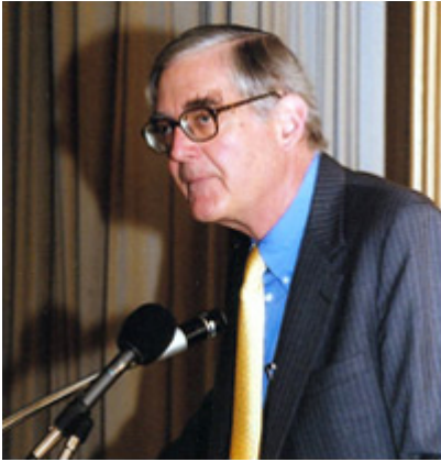
Warren Zimmermann

Lost in the barrage of images and self-serving analyses are the economic and social causes of the conflict. The deep-seated economic crisis which preceded the civil war had long been forgotten. The strategic interests of Germany and the US in laying the groundwork for the disintegration of Yugoslavia go unmentioned, as does the role of external creditors and international financial institutions. In the eyes of the global media, Western powers bear no responsibility for the impoverishment and destruction of a nation of 24 million people.