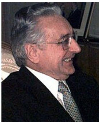
Croatian President Franjo Tuđman

The consensus among donors and international agencies was that past IMF macroeconomics reforms inflicted on federal Yugoslavia had not quite met their goal and further shock therapy was required to restore “economic health” to Yugoslavia’s successor states. Croatia, Slovenia and Macedonia had agreed to loan packages to pay off their shares of the Yugoslav debt that required a consolidation of the process begun under Ante Markovic’s bankruptcy program. The all too familiar pattern of plant closings, induced bank failures, and impoverishment has continued unabated since 1996. And who was to carry out IMF diktats? The leaders of the newly sovereign states have fully collaborated with the creditors.