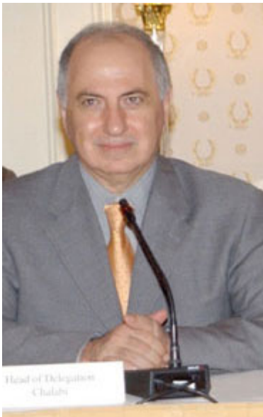
Iraqi National Congress President Ahmed Chalabi

After the invasion of Iraq and the U.S. failure to find the promised WMD caches, INC leader Ahmed Chalabi congratulated his organization as “heroes in error” for its success in using falsehoods to help get the United States to invade.