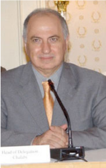
Iraqi National Congress President Ahmed Chalabi

After the invasion of Iraq and the U.S. failure to find the promised WMD caches, INC leader Ahmed Chalabi congratulated his organization as “heroes in error” for its success in using falsehoods to help get the United States to invade.