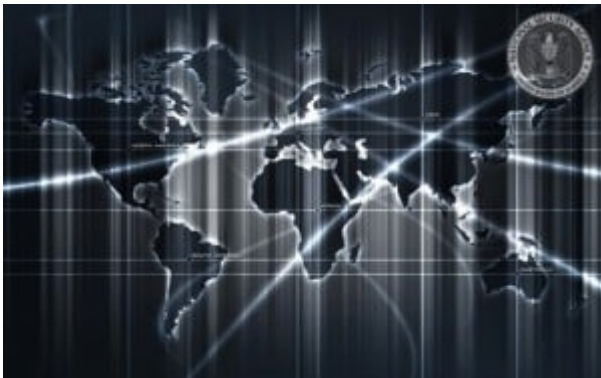
Image: Never has there been a time where technology has empowered governments more to either prevent outbreaks or design the perfect outbreak.

Never has there been a time in human history where governments have had more access to “big-data” legally or illegally. As the NSA, Facebook, Google, and other data mining operations have proven, collecting and exploiting vast quantities of information regarding personal preferences and travel habits not only gives policymakers and corporations immense insight into the current state of any given population, but also grants them varying degrees of predictive insight.