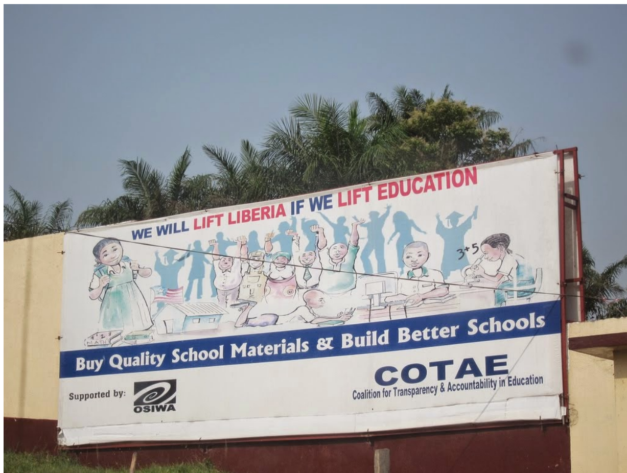
Image: For years US and other Western NGOs have meddled in Liberia's internal affairs, claiming to be building up education and the nation's healthcare system. The US in particular has participated in military intervention in Liberia and has poured billions in cash in alleged "aid." Ironical then that Liberia is one of the worst hit and least prepared nations suffering from Ebola. Above is a billboard sponsored by Open Society in Liberia's capital of Monrovia.

Despite the success quarantine has exhibited in the past, many Western policymakers have lobbied heavily against placing travel bans on infected countries or the notion of using quarantine procedures within infected countries. Open Society, a corporate-funded foundation that sponsors subversive political programs and so-called "civil society" within targeted countries, has been among the most vocal opponents of quarantining infected communities and countries.