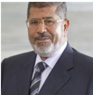
Former Egyptian President Mohamed Morsi

The other pillar of royal rule is western imperialism. The Brits, and then the Americans, partnered with the House of Saud as a bulwark against secular nationalism in the Arab and Muslim world. It was only logical that the Saudis would ally with the American CIA to create the world’s first international jihadist network to overthrow a secular leftist government in Afghanistan in the late 1970s, thus bringing forth al Qaida and its many offspring.