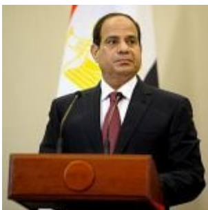
Incumbent Egyptian President Abdel Fattah el-Sisi

The royal family of Qatar, with a citizen population of only 200,000 (the rest of the 2 million inhabitants are non-citizens, mostly low-wage workers, a plurality from India), is also nominally Wahhabist. But they chose a different path to political legitimacy — while also