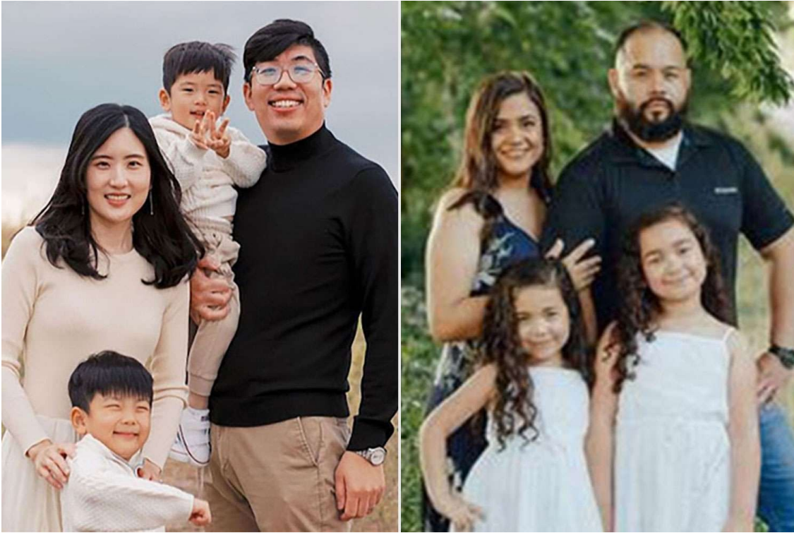
These are the victims of the Texas Mall Shooting

It all sounds very serious, doesn't it? It sounds like something that policymakers should be aware of so they can tighten regulations on these potentially-lethal medications. It also sounds like something that pharmaceutical industry would try to keep out of the newspapers so people don't see the connection between these drugs and the mayhem they produce. Simply put, the truth is being hidden for power and profits. What else is new? Here's more background from another article: