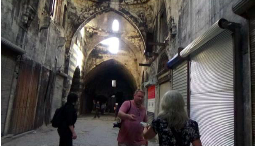
War-damaged Al-Medina Souk, Aleppo, Syria

Once a country is destroyed and occupied, local industries can be replaced by predatory monopolies. Currently, for example, Western military forces occupy oil rich areas of Syria. Big Oil would be a driver behind this.