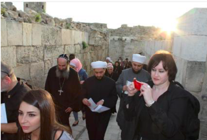
Aleppo Citadel

Terrorists seek to obliterate Syria's tolerant and pluralist identity. Syrians self-identify as Syrians, and not by any religious affiliation.