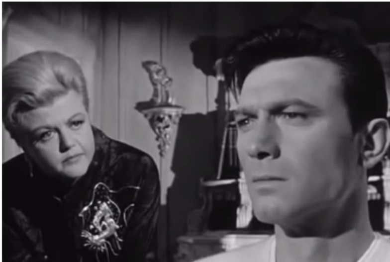
Angela Lansbury and Laurence Harvey in The Manchurian Candidate, in 1962. That movie, and the Richard Condon novel it was drawn from, imagined foreign attempts to direct the outcome of a U.S. presidential election. Yesterday the U.S. government said that Russian hackers have been deliberately trying to change the outcome of this year’s race.