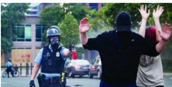
Image on the right: Brutal: A Minnesota police officer sprays protesters with pepper spray at the weekend

To accomplish this daunting task, a sustained social struggle that has as its goal