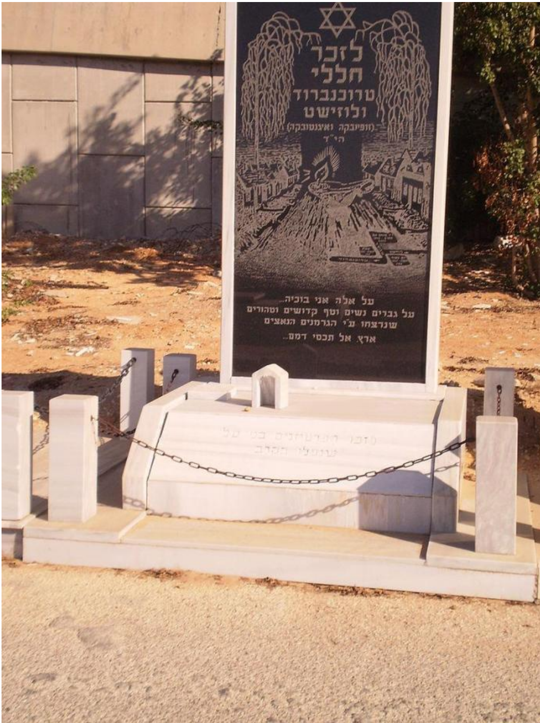
Holocaust memorial to Trochenbrod and Lozish Jewry at the Holon Cemetery in Israel.

Given this history and the dirty war that western Ukraine's coup regime has waged on its eastern regions for eight years now, Americans should ask their government to cease supporting Ukraine's western government.