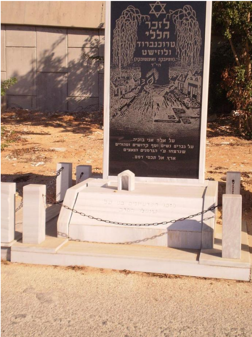
Holocaust memorial to Trochenbrod and Lozish Jewry at the Holon Cemetery in Israel.

Given this history and the dirty war that western Ukraine's coup regime has waged on its eastern regions for eight years now, Americans should ask their government to cease supporting Ukraine's western government.