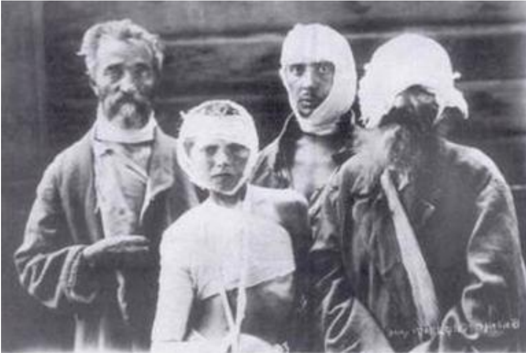
Victims of Kyiv pogrom in 1918.

More pogrom-like violence by “Ukrainian Nationalists, Polish officials, and Red Army soldiers...” killed tens of thousands of Jews between 1918-1920. [14] This contributed to my grandfather moving to Maryland by the end of the 1920s. [15]