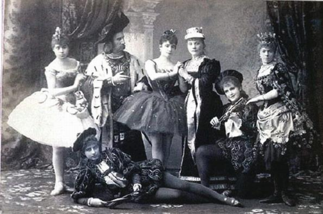
A publicity photo for the premiere of Tchaikovsky's ballet The Sleeping Beauty (1890).

While this era saw the rise of ballet as a truly international art form, Romanticism in ballet declined rapidly “as ballets were so weighted towards the feminine and the febrile”, while “male dancers were frequently relegated to the role of porteur [supporting the ballerina]”.