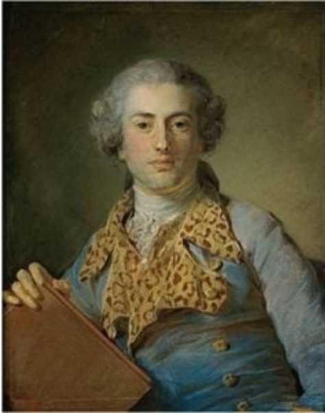
Image on the right: Jean-Georges Noverre (1727–1810) was a French dancer and balletmaster, and is generally considered the creator of ballet d’action, a precursor of the narrative ballets of the 19th century. His birthday is now observed as International Dance Day.

Denis Diderot, for example, (one of the editors of the quintessential enlightenment project: the Encyclopédie) wrote in his essay ‘Entretiens sur ‘Le Fils Naturel’: