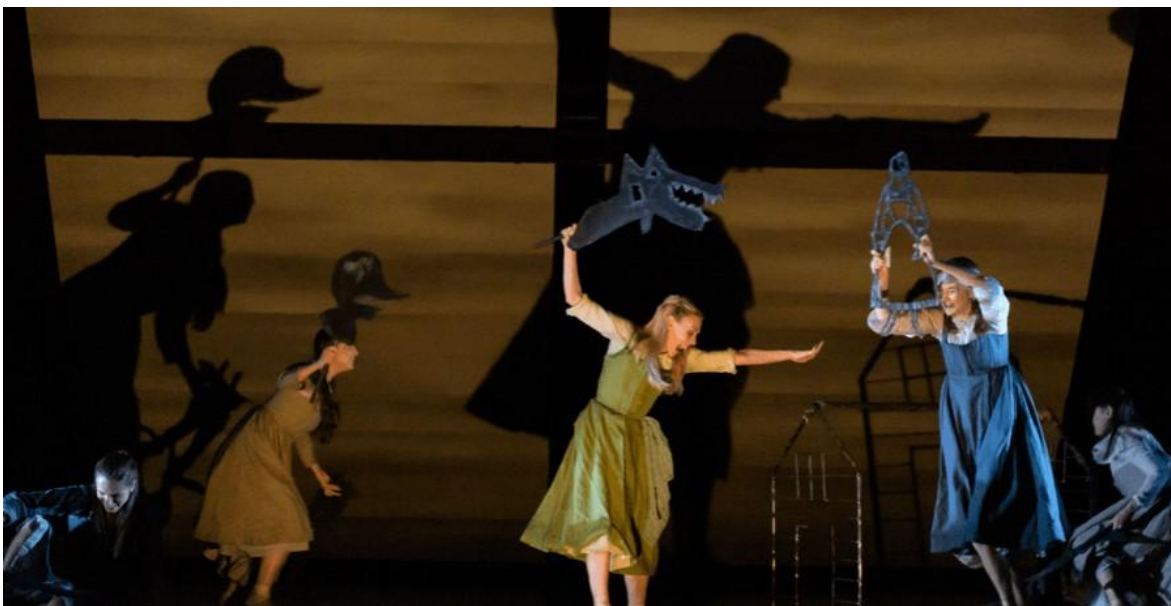
Scottish Ballet’s The Crucible - Theatre Royal, Glasgow.