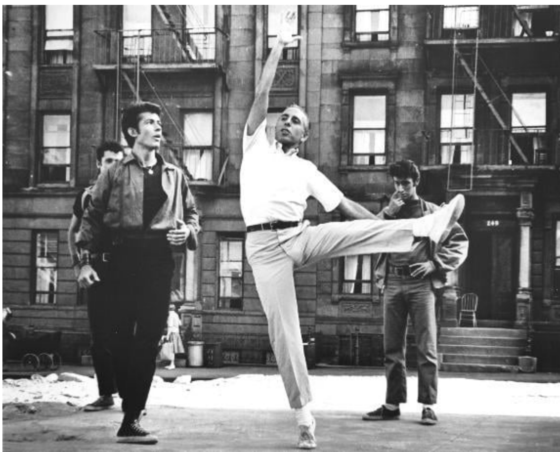
Rehearsals for West Side Story , 1960 | American dancer , choreographer, and director Jerome Robbins (1918 - 1998) (in white) demonstrates a dance move to American actor George Chakiris (left, foreground) during the filming of 'West Side Story,' directed by Robbins and Robert Wise, New York, New York, 1961.

Cinema also aided the popularity of dance in the twentieth century as can be seen in films featuring ballet in the 1940s ( The Red Shoes ), tap dancing in the 1950s ( Singin' in the Rain ), modern dance in the 1960s ( West Side Story ), disco in the 1970s ( Saturday Night Fever ), club/performance partner dancing in the 1980s ( Dirty Dancing ), tango in the 2000s ( Chicago ) and modern dance theatre in the 2010s ( Pina ). The global popularity of Hollywood musicals and Bollywood song-and-dance sequences have made dance an important element to be considered in any new film musical.