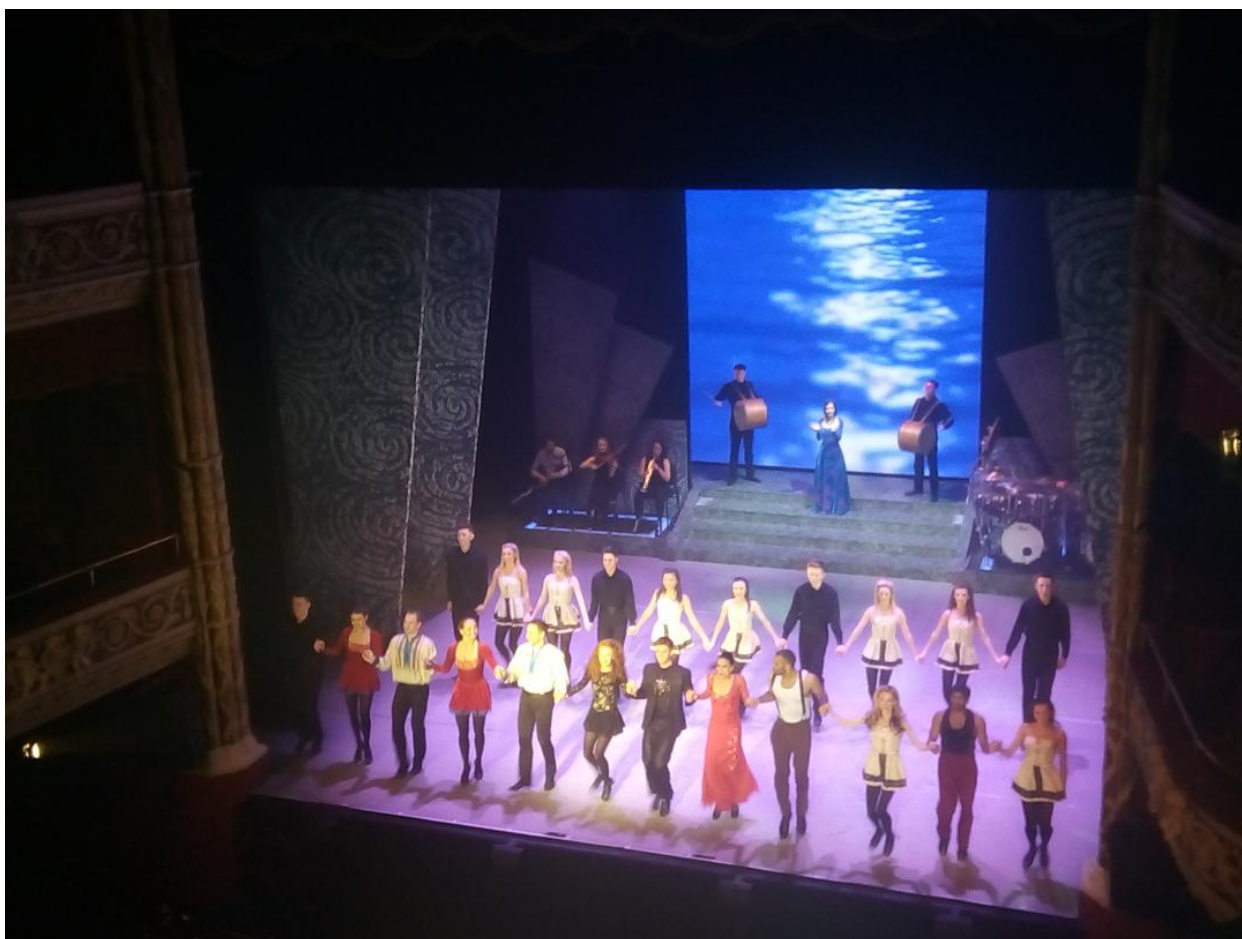
Riverdance cast at the Gaiety Theatre, Dublin, 2019.

Dance has become even more prevalent in the 21st century with the internet and global satellite media, for example, through apps like TikTok and dance shows on TV. Riverdance is still touring and ballet is as popular as ever. Novelty and fad dances still come and go. Social dancing and traditional dance are still in demand due to classes, competitions and people's natural love of dance as a form of socialising.