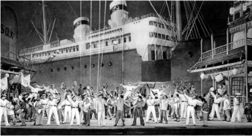
A scene from the 1927 production of The Red Poppy

dying, she gives her compatriots a red poppy as an emblem in their fight for freedom.”