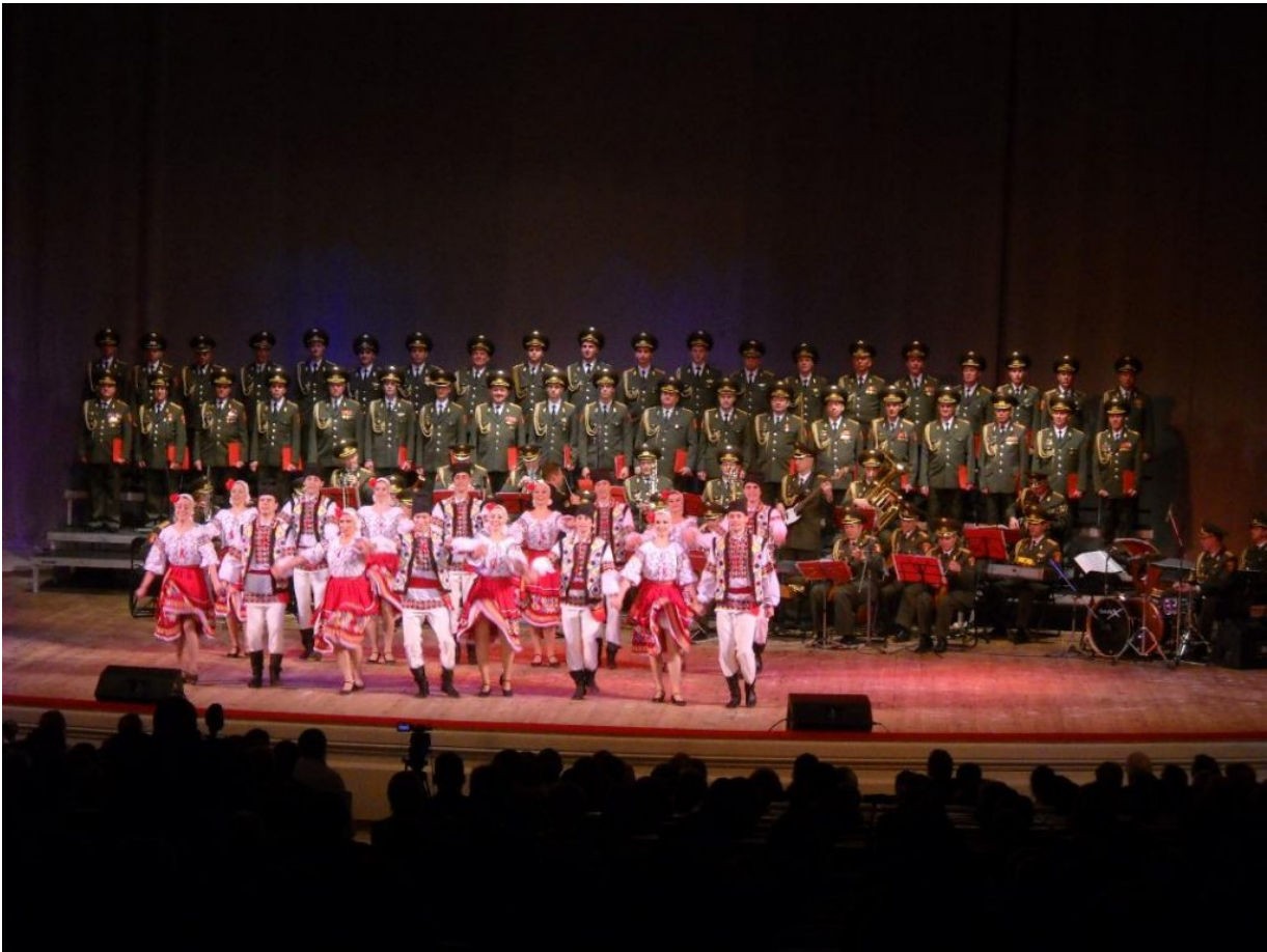
The Alexandrov Choir with Dance Ensemble, Warsaw 2009 (Also known as the Red Army Choir and the Song and Dance Ensemble of the Russian Army)

after the Russian revolution of 1917 where the state supported and promoted folk dance as part of the culture of the people. The Red Army Choir, an official army choir of the Russian armed forces, was set up in the 1920s, and by the 1930s was touring with an ensemble of dancers.