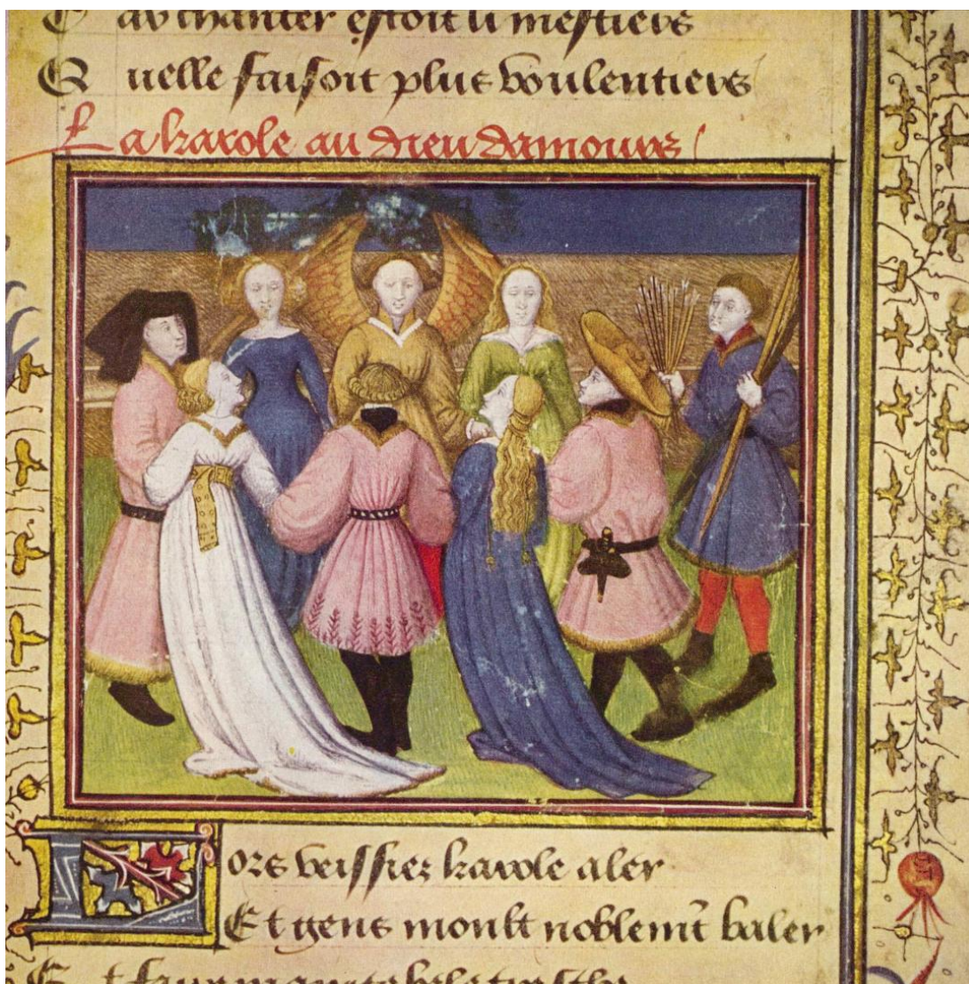
From a manuscript of the Roman de la Rose , c. 1430.

In Europe during the Middle Ages there are references to circular dances called 'carole' from the 12th and 13th centuries. People also danced around trees holding hands in a leader and refrain style. These dances and songs became the carols we know today.