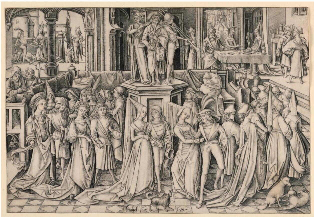
Dance at Herod's Court , ca. 1490, Israhel van Meckenem, engraving . Couples circling in a basse danse.

However, the literary history of dance in terms of detailed descriptions goes back to Italy in the middle of the fifteenth century after the start of the Renaissance. During this time there also developed a divergence between court dances and country dances, between performance and participation. Court dancers trained for dances for entertainment, while anyone could learn country dances. At court formal display dancing would be followed by informal country dances for all to participate in.