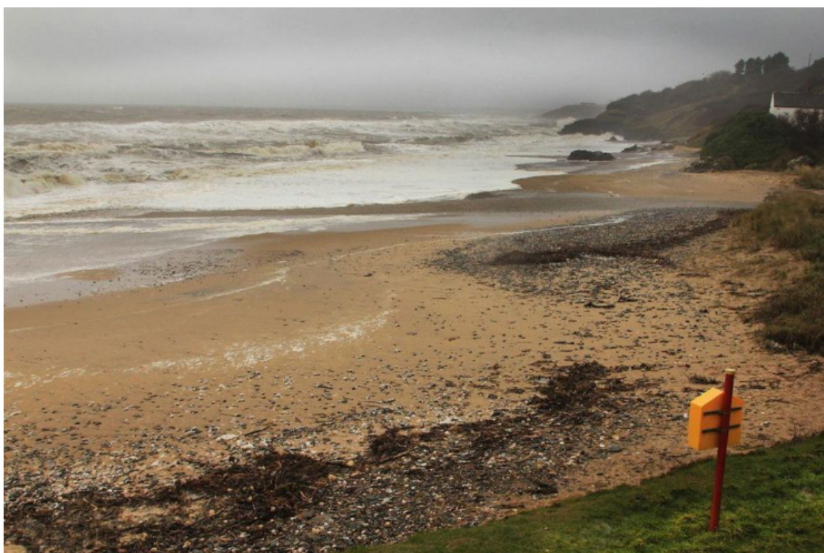
Ballymoney Beach, Wexford.

The woman's body was subsequently taken to the mortuary at University Hospital Waterford (UHW) where a post-mortem examination will be carried out and a file prepared for the coroner.