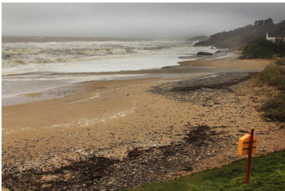
Ballymoney Beach, Wexford.

The woman's body was subsequently taken to the mortuary at University Hospital Waterford (UHW) where a post-mortem examination will be carried out and a file prepared for the coroner.